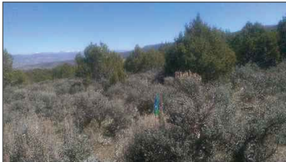
REFERENCE AREA LOOKING EAST 3/30/2015