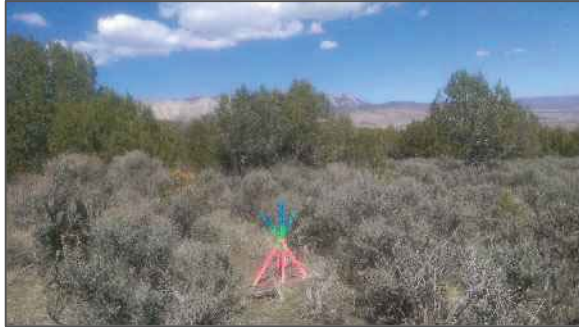
REFERENCE AREA LOOKING NORTH 3/30/2015