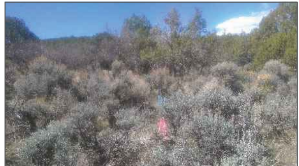
REFERENCE AREA LOOKING WEST 3/30/2015

REFERENCE AREA CENTER STAKE (DO NOT DISTURB) LATITUDE (NAD 83) NORTH 39.459061 DEG. LONGITUDE (NAD 83) WEST 107.905665 DEG.