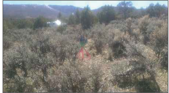
REFERENCE AREA LOOKING SOUTH 3/30/2015