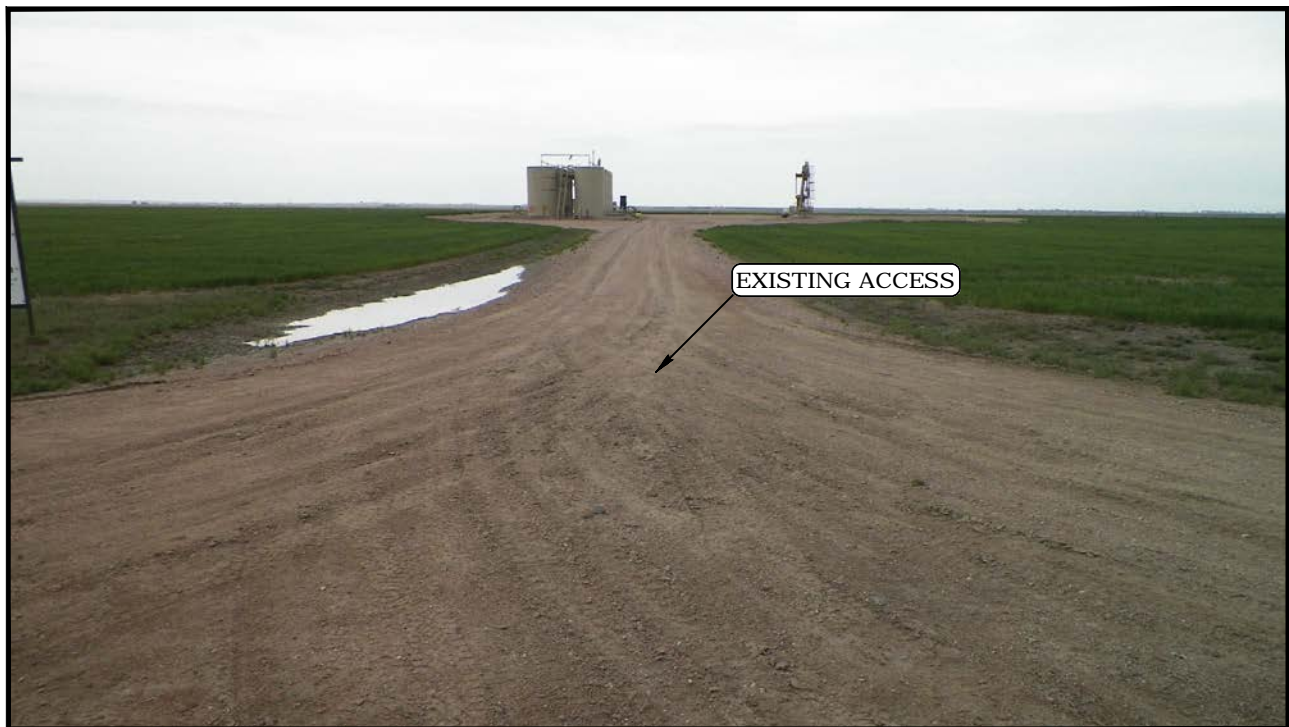
PHOTO: VIEW FROM BEGINNING OF EXISTING ACCESS