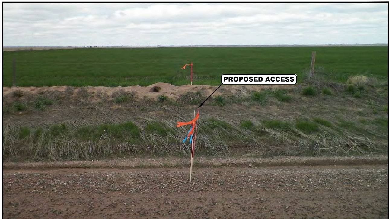
PHOTO: VIEW FROM BEGINNING OF PROPOSED ACCESS