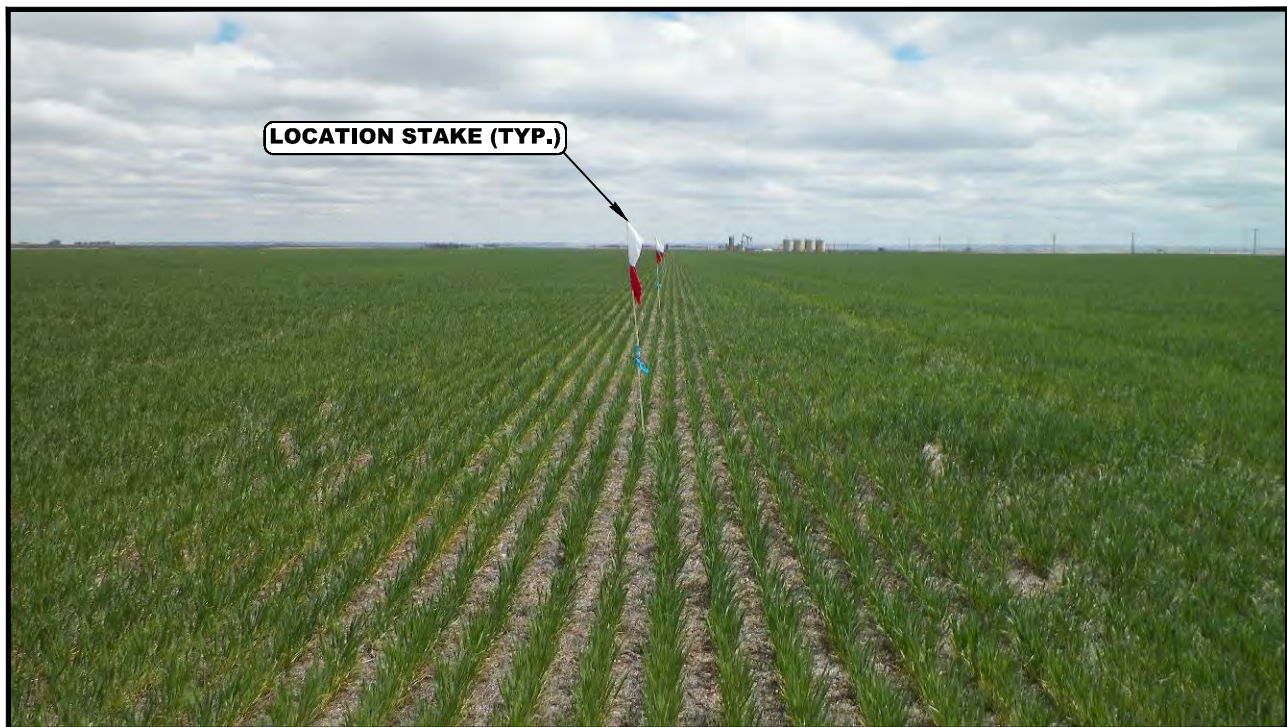
PHOTO: VIEW OF LOCATION STAKES