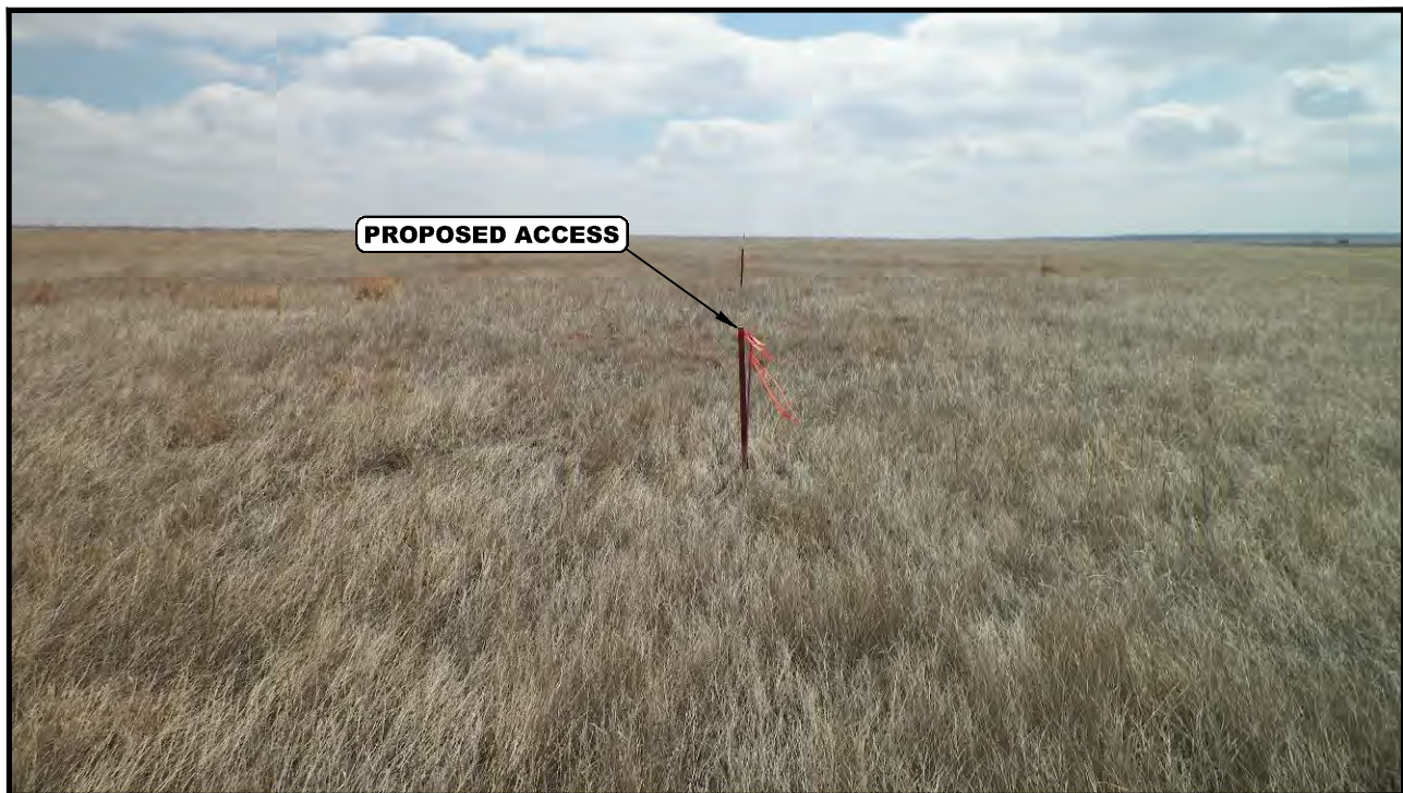
PHOTO: VIEW FROM BEGINNING OF PROPOSED ACCESS