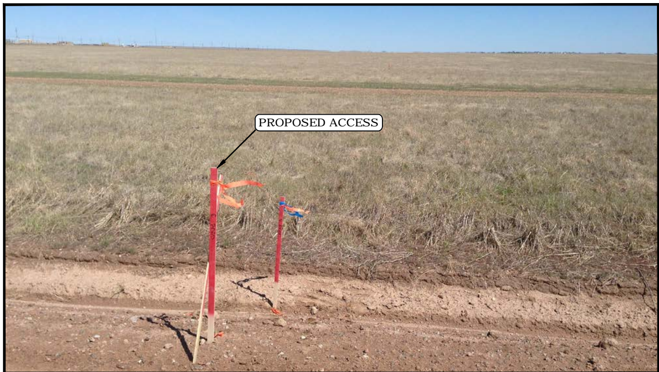
PHOTO: VIEW OF PROPOSED ACCESS