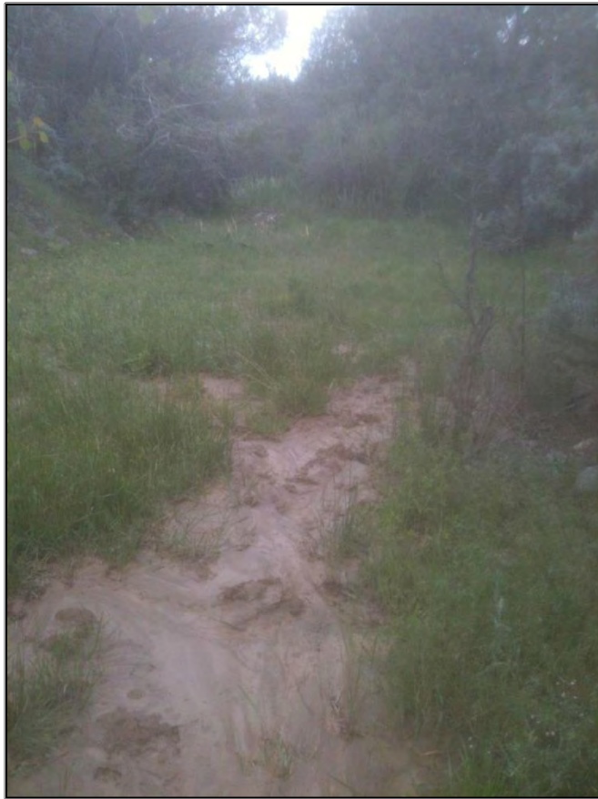
Photo 2. Drainage downstream of sampling location KP 3. (May 18, 2015)