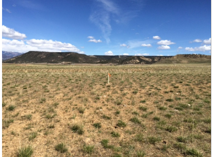
Valley Farms G Pad 4/9/15 Looking East