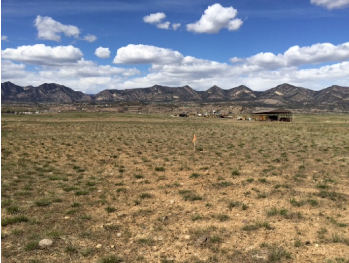
Valley Farms G Pad 4/9/15 Looking North