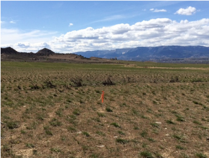
Valley Farms G Pad 4/9/15 Looking West