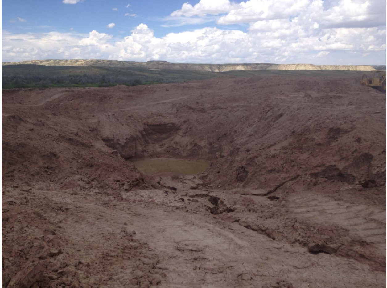
Area of pit described in Remediation project number 8333. Note; erosion at equipment access road. Estimated size is 60 diameter and 60' deep. Picture is facing north.