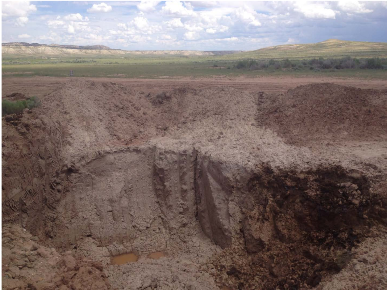
Area of pit id 100601, Approximate size 20' diameter, 15' deep. Approximate location is 40.979746, - 108.308608. Picture is looking north-west. Note; obvious hydrocarbon contamination.