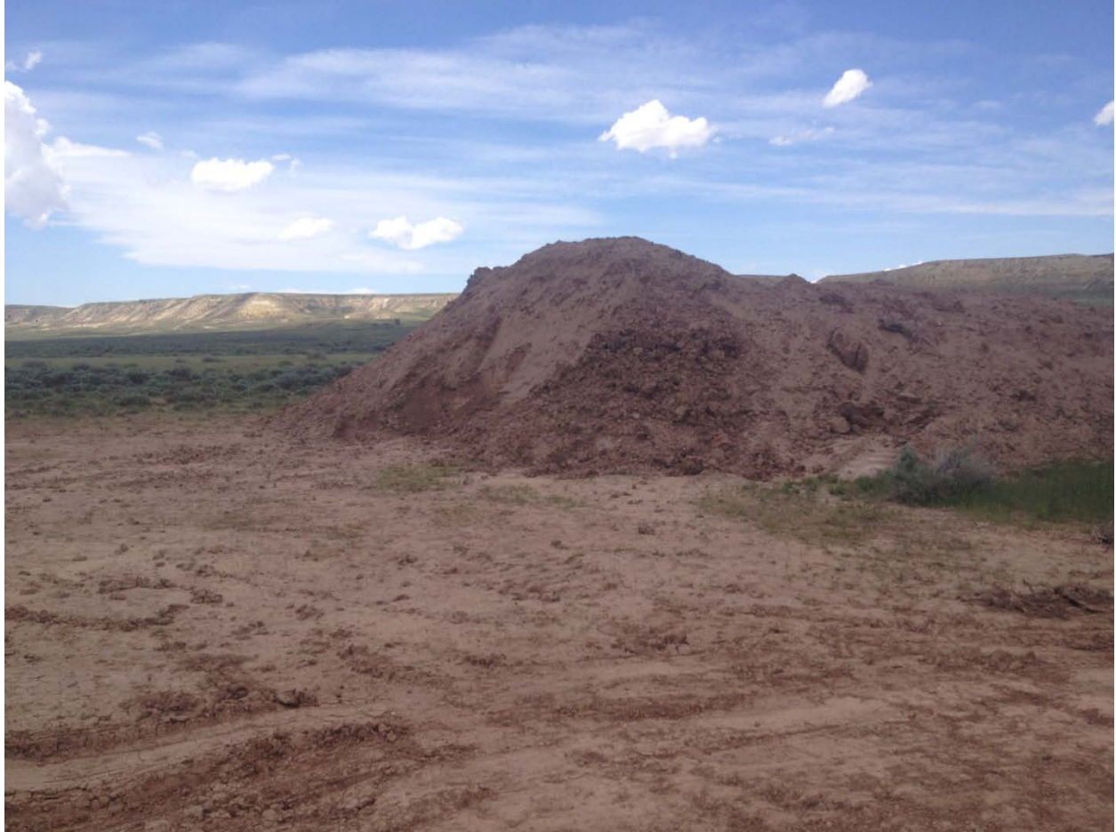
Soil pile 1 of 2 large piles, appears to be clean fill, operator should confirm what soil is. Approximate location is 40.97982 -108.30908. Picture is facing north-west