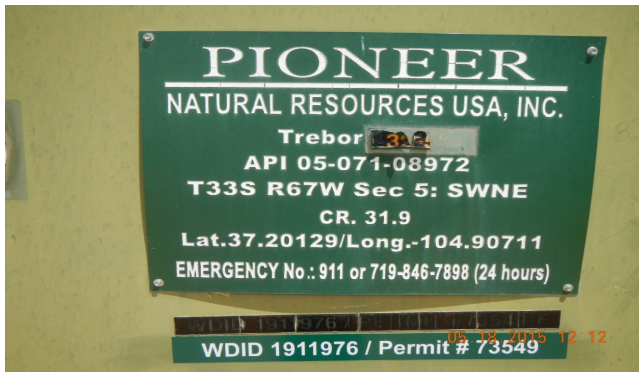
photo 1: Well sign, Trebor 32-5V. Well name label is faded and peeling off.