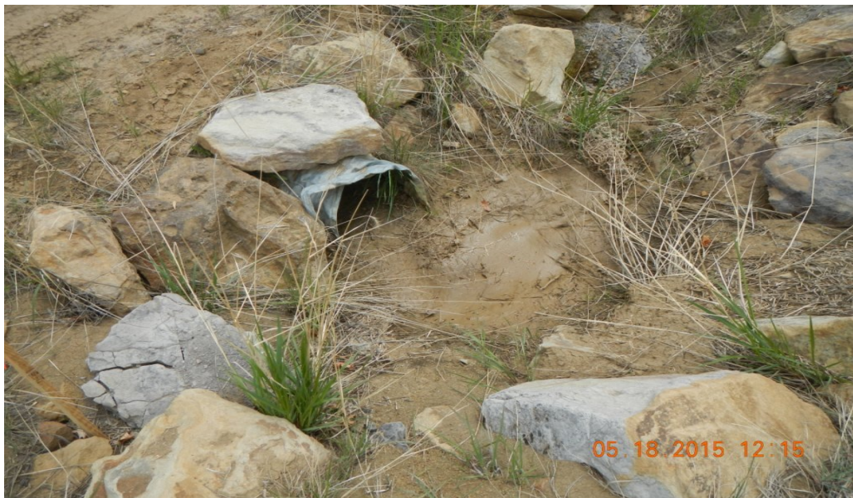
photo 6: Culvert along the access road is partially filled with sediment.