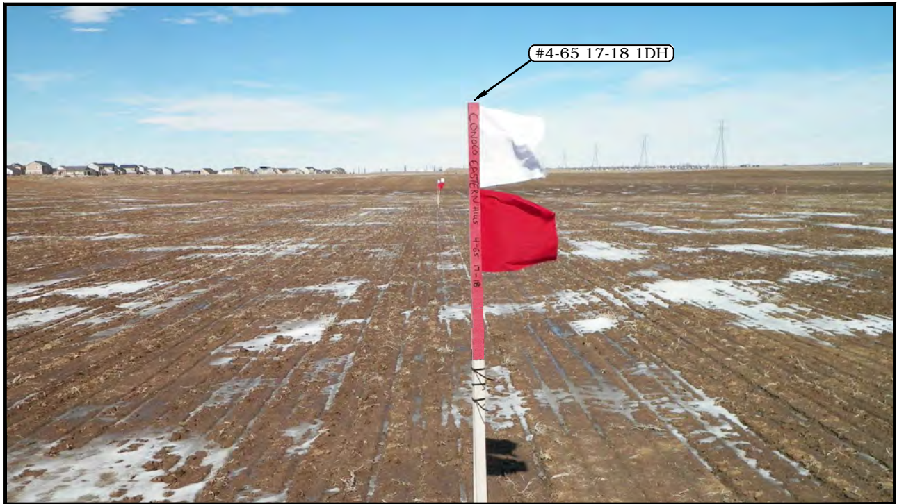
PHOTO: VIEW OF LOCATION STAKES