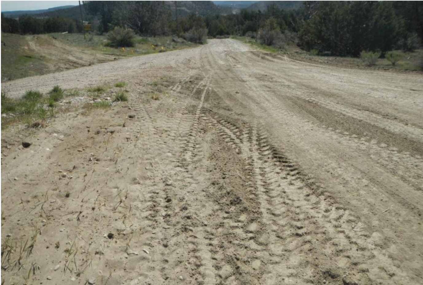
Photo 3. View of entrance to well pad area facing southeastward along road alignment.