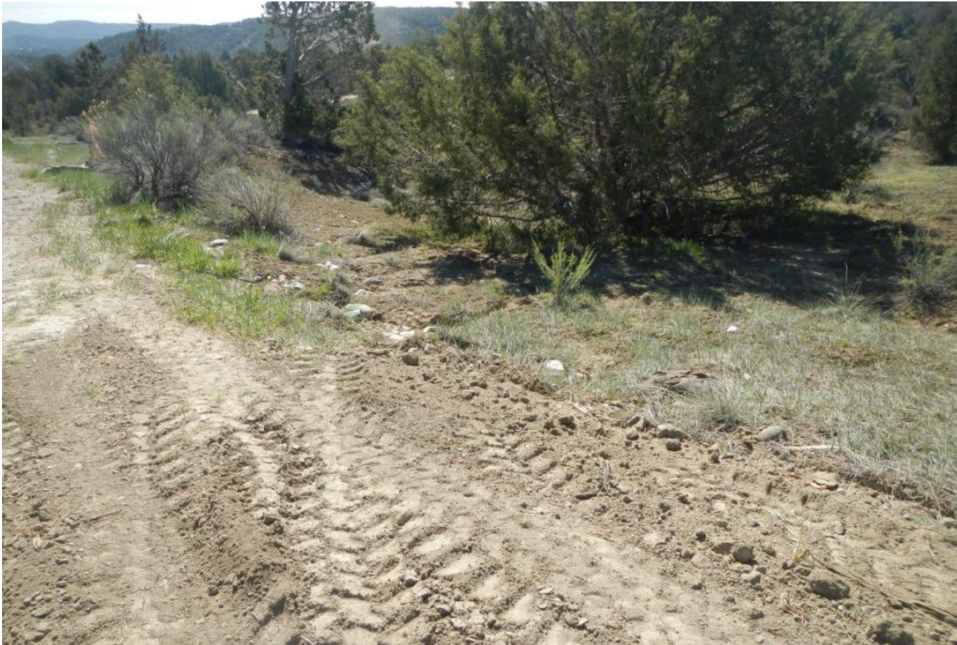
Photo 4. View of southern portion of road shown in Photo 3. This is where it appears stormwater runoff is eroding downstream of the project area.