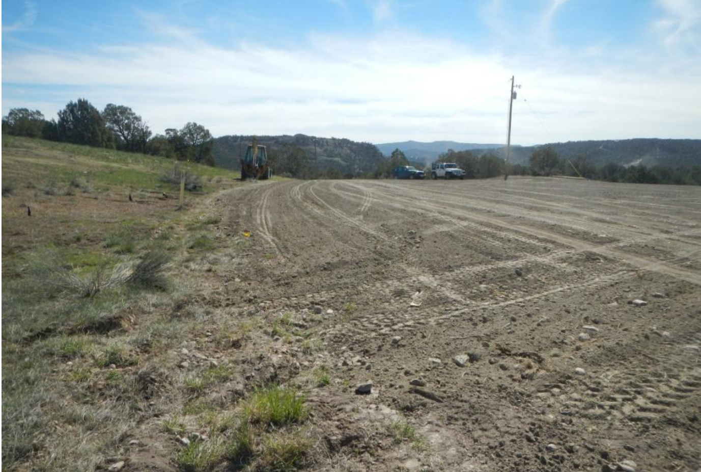
Photo 1. View of northern portion of well pad from northwestern corner facing eastward. An existing surface owner road crosses through this portion of the well pad.