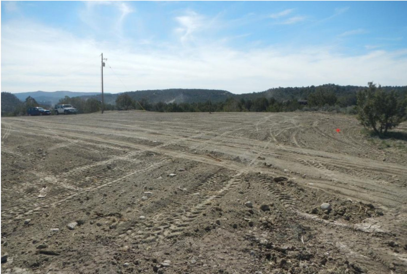
Photo 5. View of status of final reclamation from northeastern corner of well pad facing center.