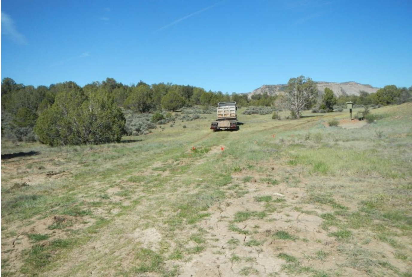
Photo 2. View of surface owner road (two-track) where it continues westward from the well pad. Truck is on the road and is a contractor for surface owner who is improving this portion of the road for access to home site.