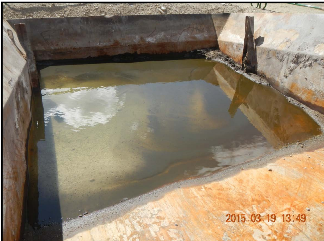
Water and free product.