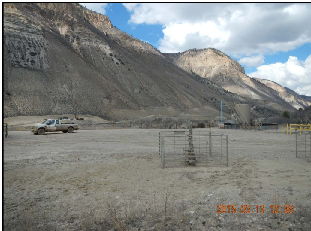
Fenced well head. Tank with secondary containment.