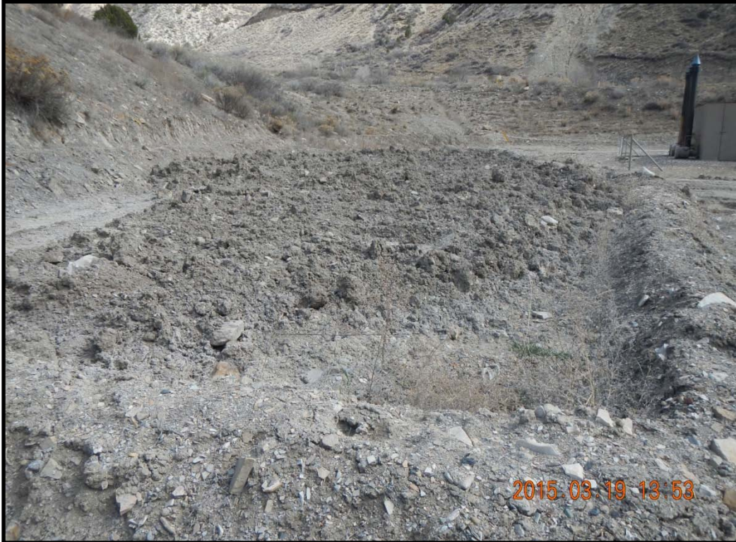
Landfarming operation. Bermed. Some weed.