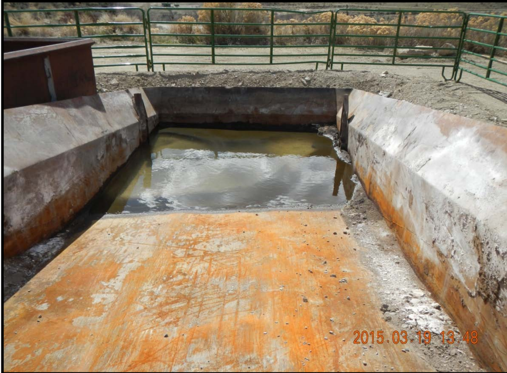
Metal container with water and free product.