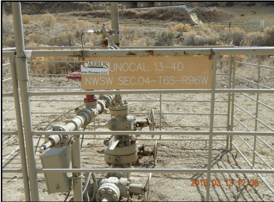
Well head. Sign and fence.