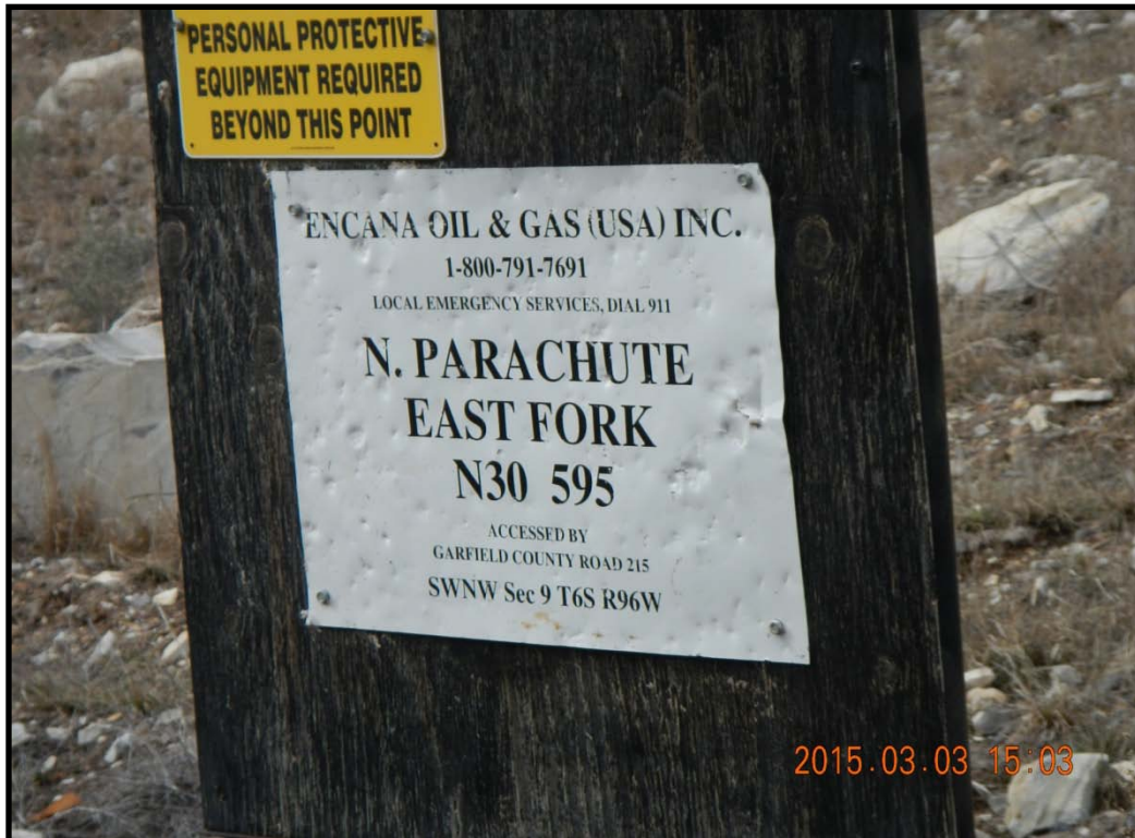
Sign at the entrance