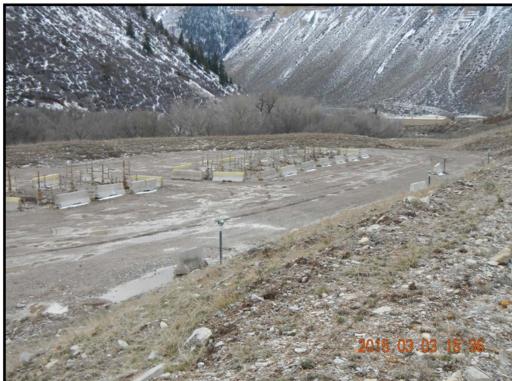
View of the pad and wellheads from the former pit location.