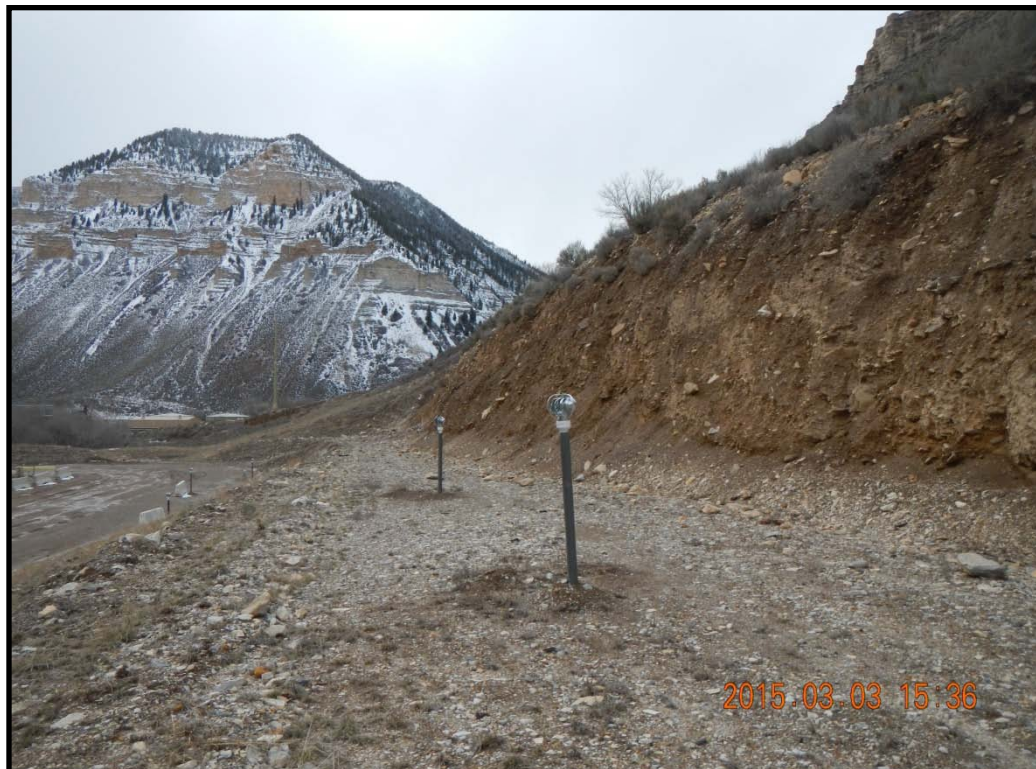
SVE system installed in the location of the former pit.