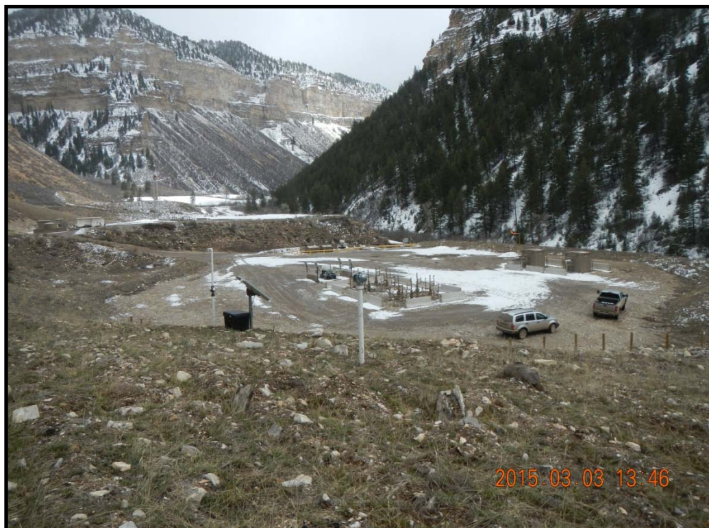
View of the pad from top of stockpile with in-situ remediation. Stockpiled material has been contoured in preparation for future reclamation.