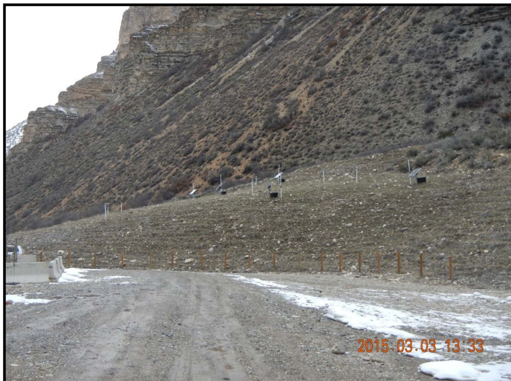
Lower right corner of photo: Location of pit #425547 (closed and backfilled). Center of photo: stockpile of impacted material with in-situ remediation system (SVE).