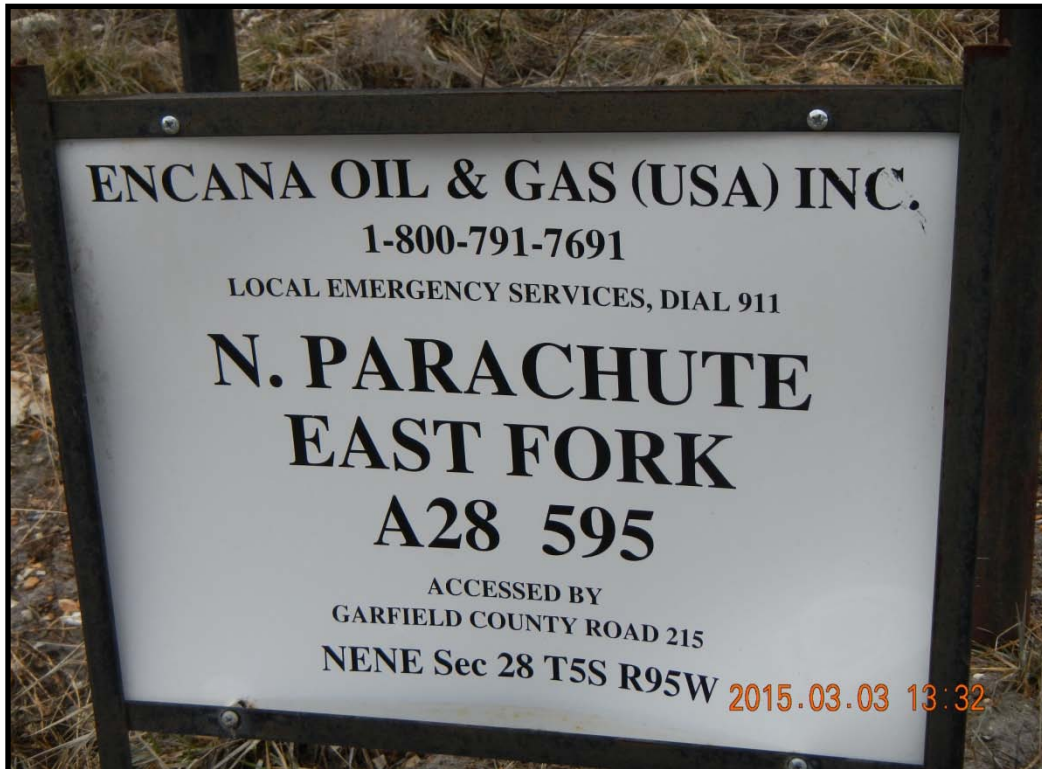
Sign at the entrance.