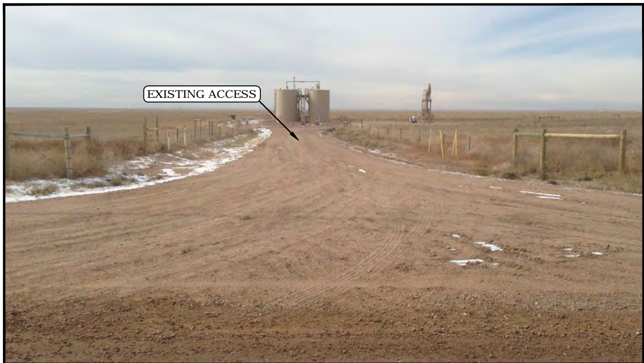
PHOTO: VIEW FROM ALONG EXISTING ACCESS