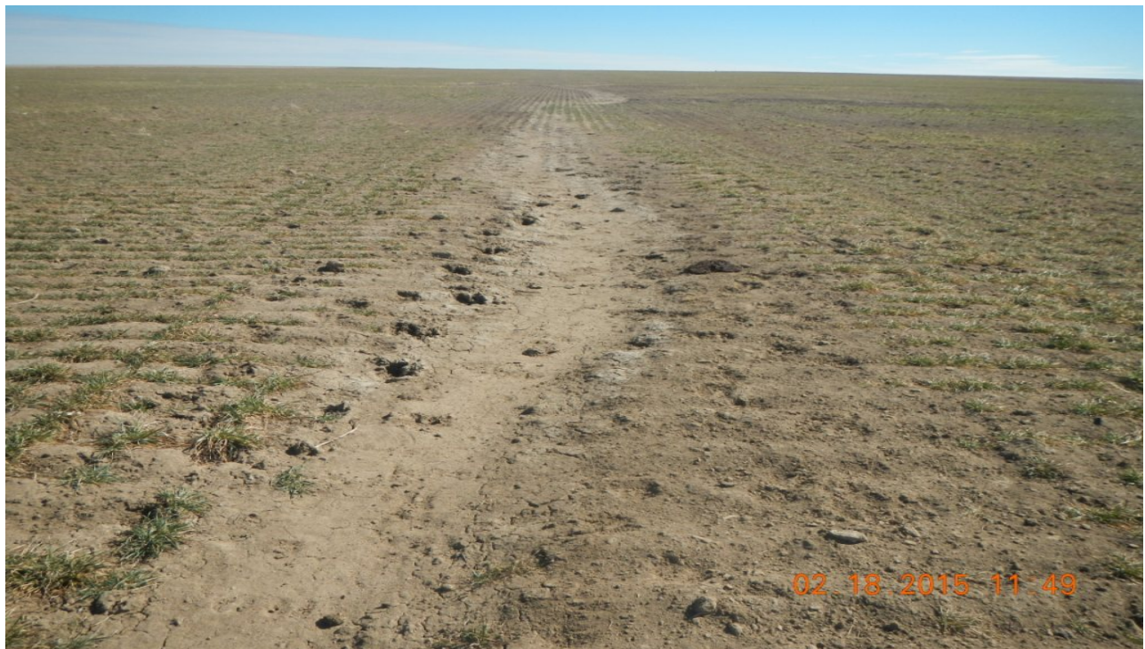
photo 1: Facing east towards the location. Evidence of access road does not have crop growth.