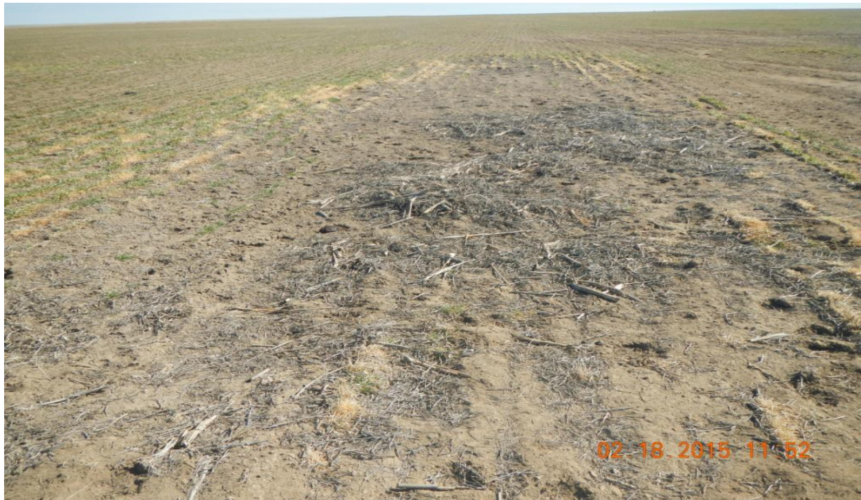
photo 3: North side of the location. Area of subsidence with no crop growth approximately 60'x20'.