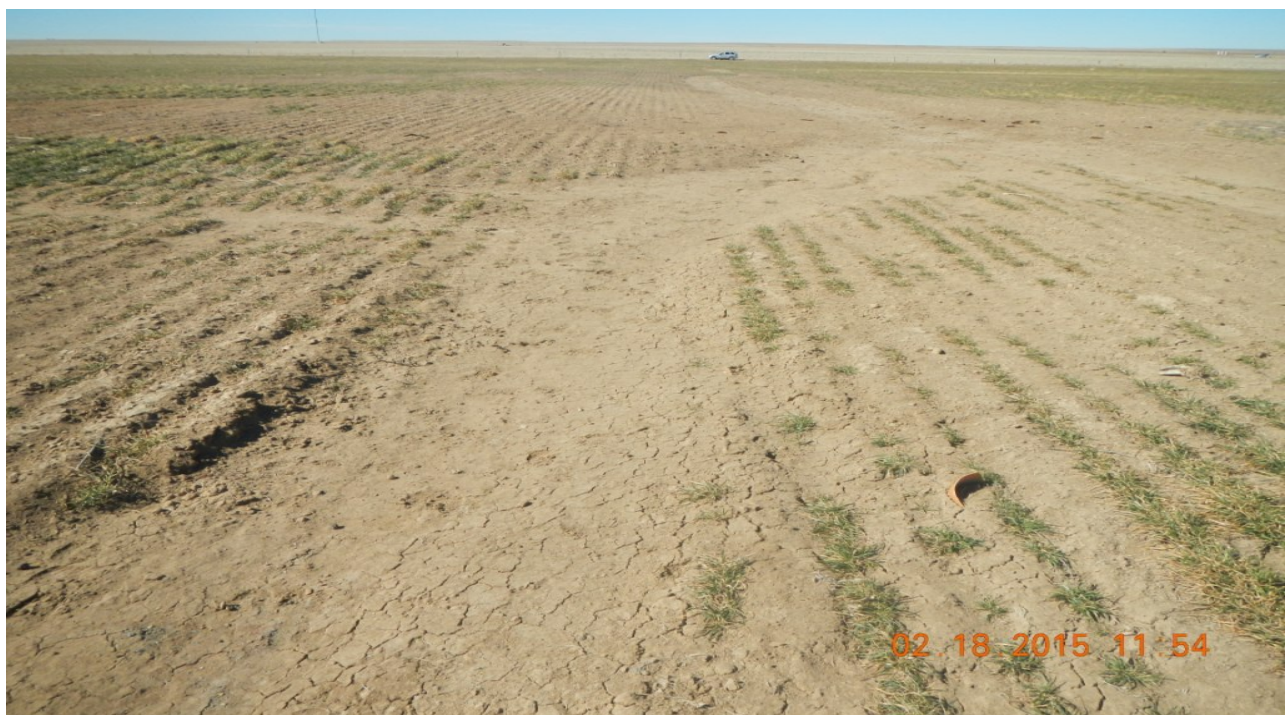
photo 2: Facing west from the location. Evidence of possible erosion through center of the location.