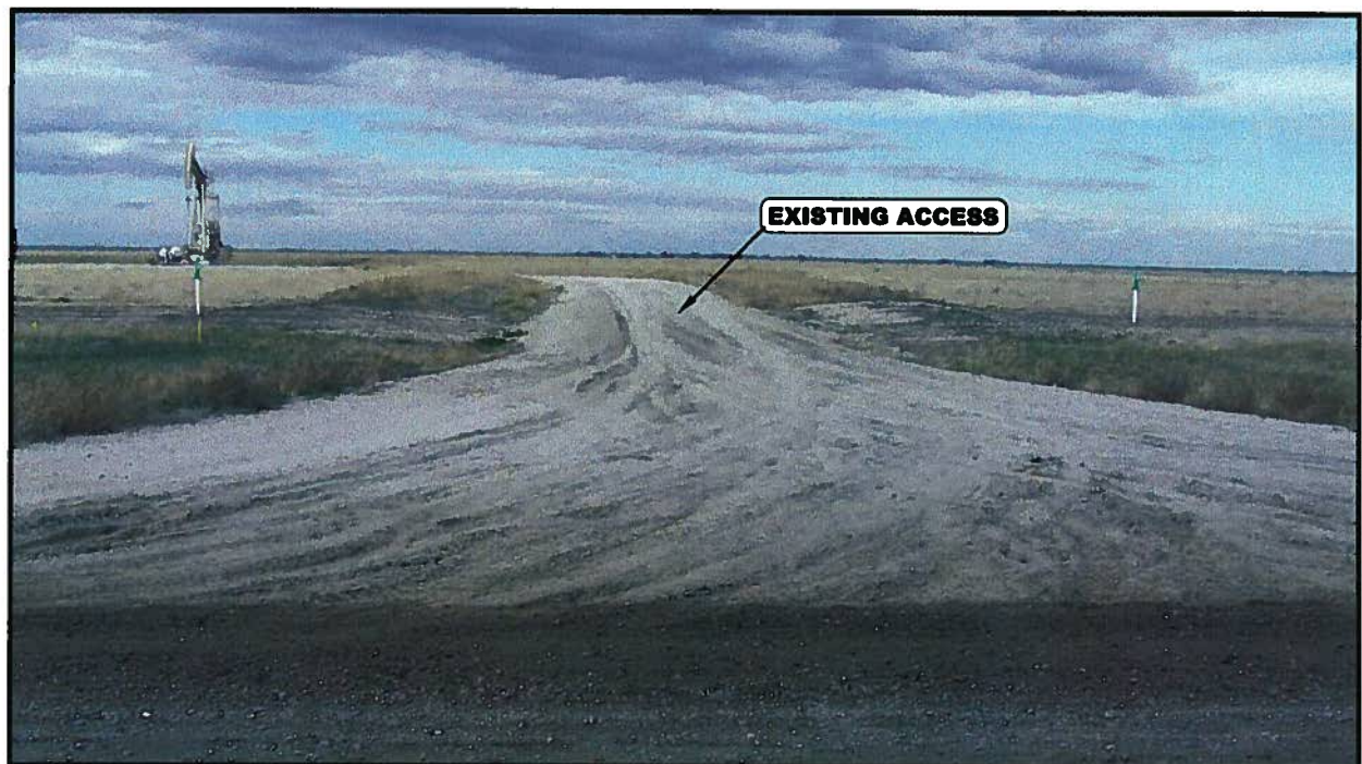
PHOTO: VIEW FROM ALONG EXISTING ACCESS