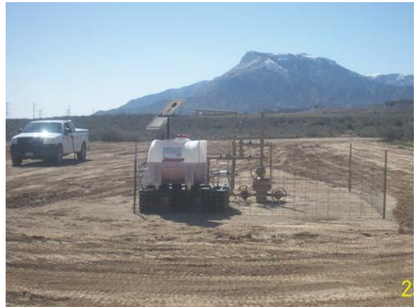
PAD LOCATION LOOKING EAST