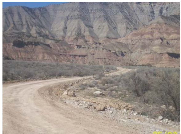
PAD ACCESS LOOKING NORTHERLY