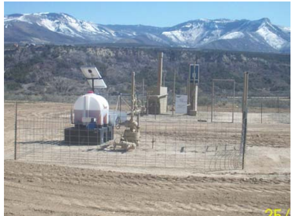
PAD LOCATION LOOKING SOUTH