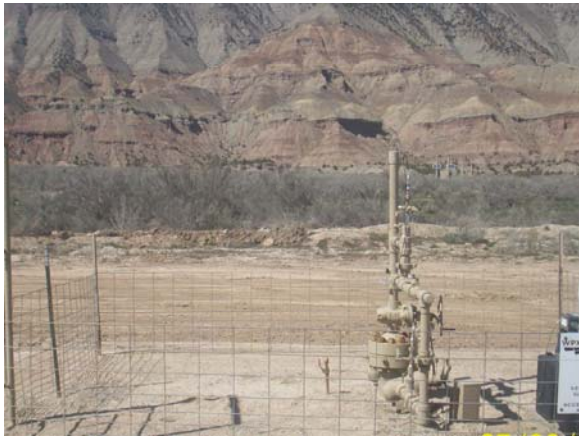
PAD LOCATION LOOKING NORTH

PA 732-34-5, PA 732-31-32, PA 732-21-32, PA 732-24-5