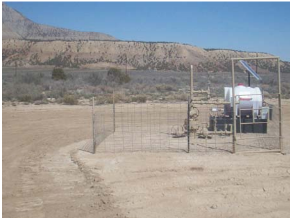
PAD LOCATION LOOKING WEST