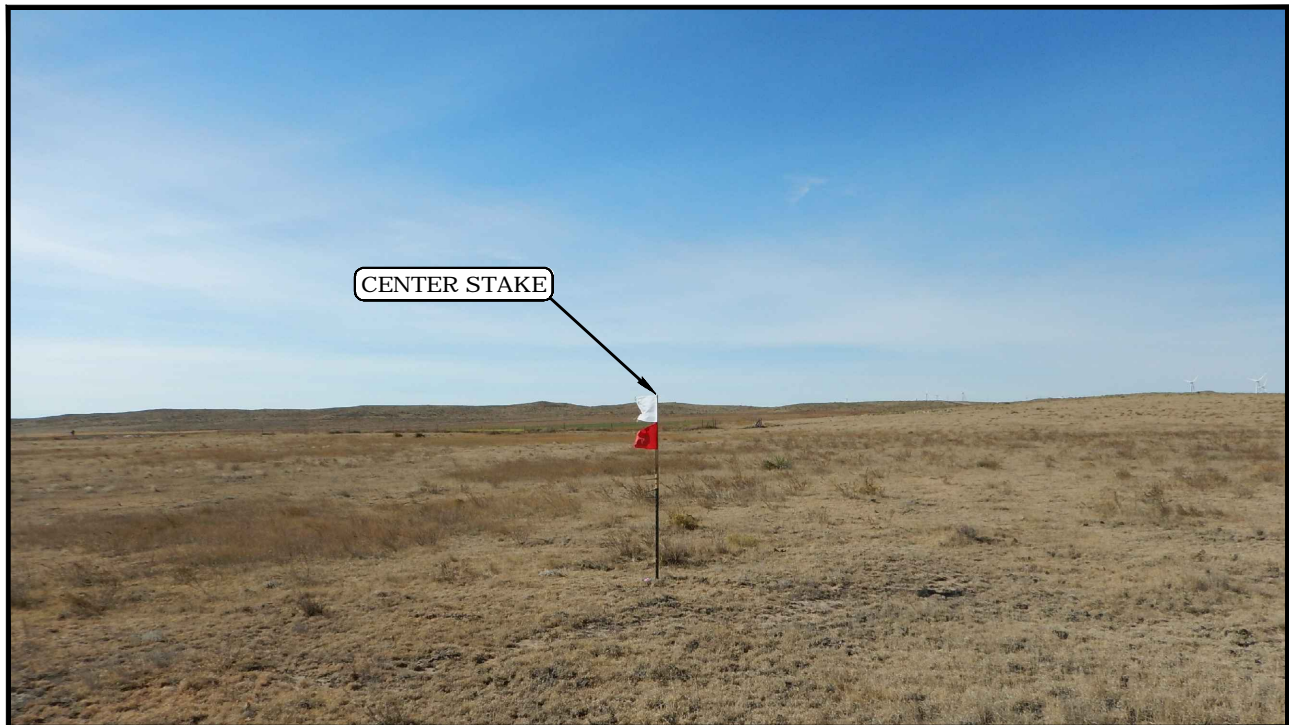
PHOTO: VIEW OF CENTER STAKE