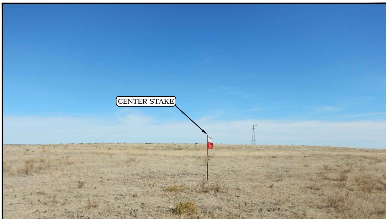
PHOTO: VIEW OF CENTER STAKE