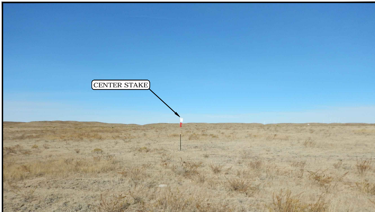
PHOTO: VIEW OF CENTER STAKE