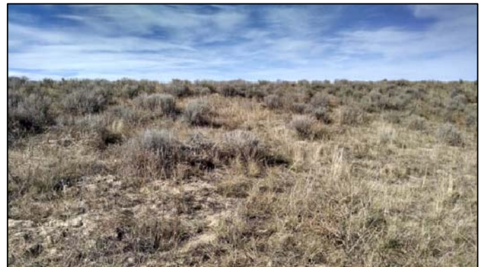
REFERENCE LOCATION LOOKING WEST

I:\SS200DE\04\Share\FES\Projects\1319-01_BONANZA\61\WID\STATE PRONGHORN 44-32 MAP.dwg SAVED DATE 2014-11-11 14:54