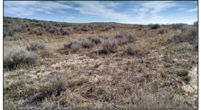
REFERENCE LOCATION LOOKING EAST