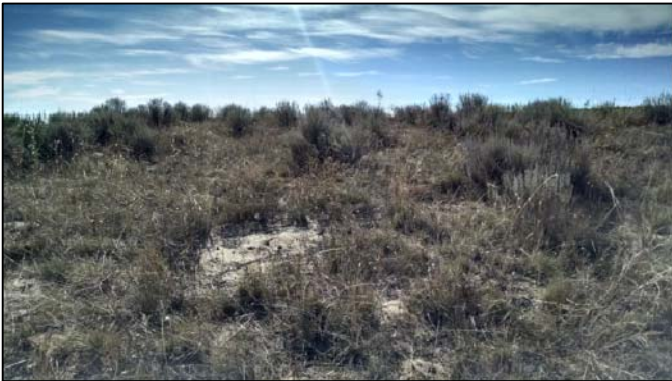
REFERENCE LOCATION LOOKING SOUTH