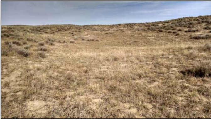
REFERENCE LOCATION LOOKING NORTH