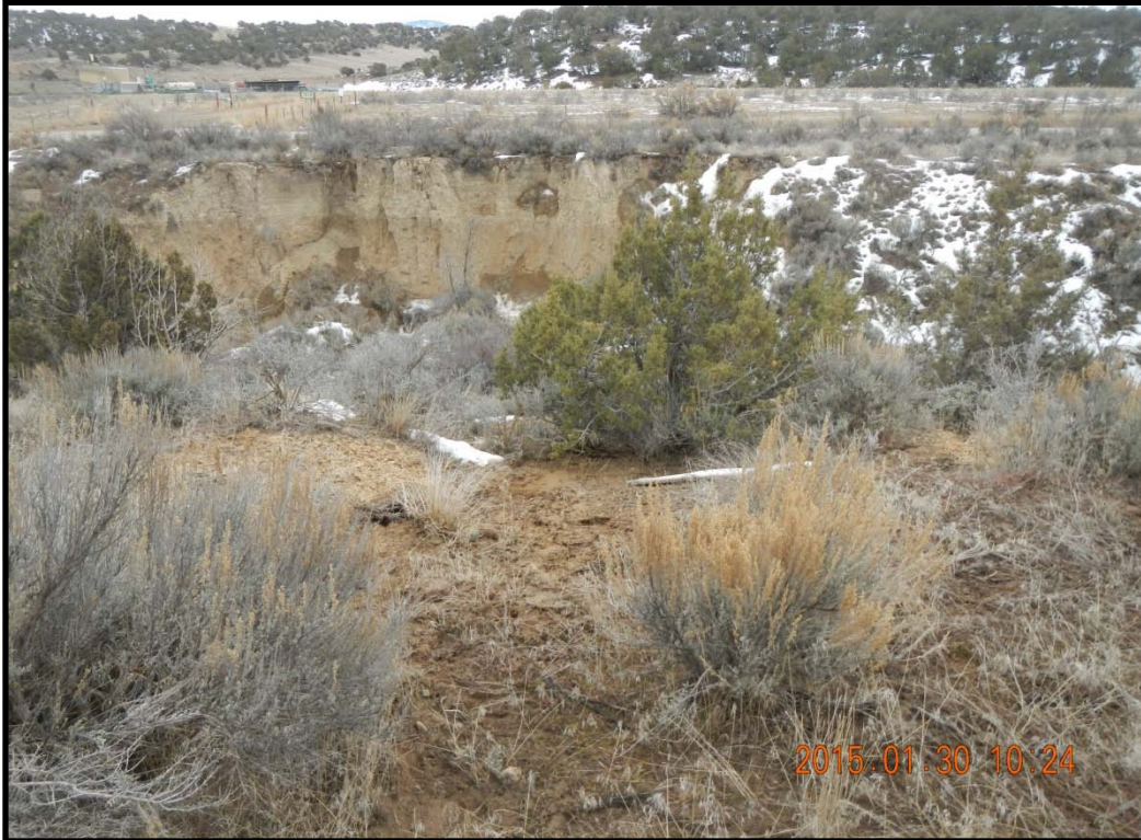
Looking East toward Dry Creek.