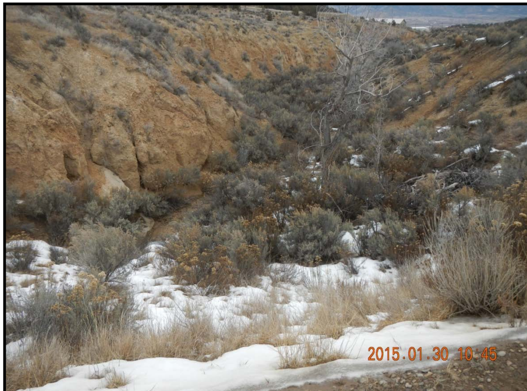
Dry Creek flowing North. View from dirt road. Exit side of culvert. Soil sample downgradient of the culver and around the curve as a compliance point.