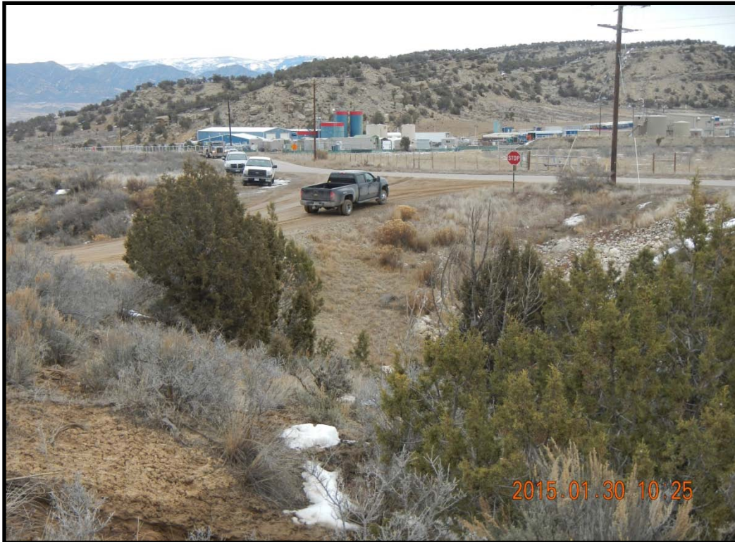
Dry Creek flowing North to the Colorado River. Across County Road, Encana Centralized E&P Waste Management Facility # 149004.