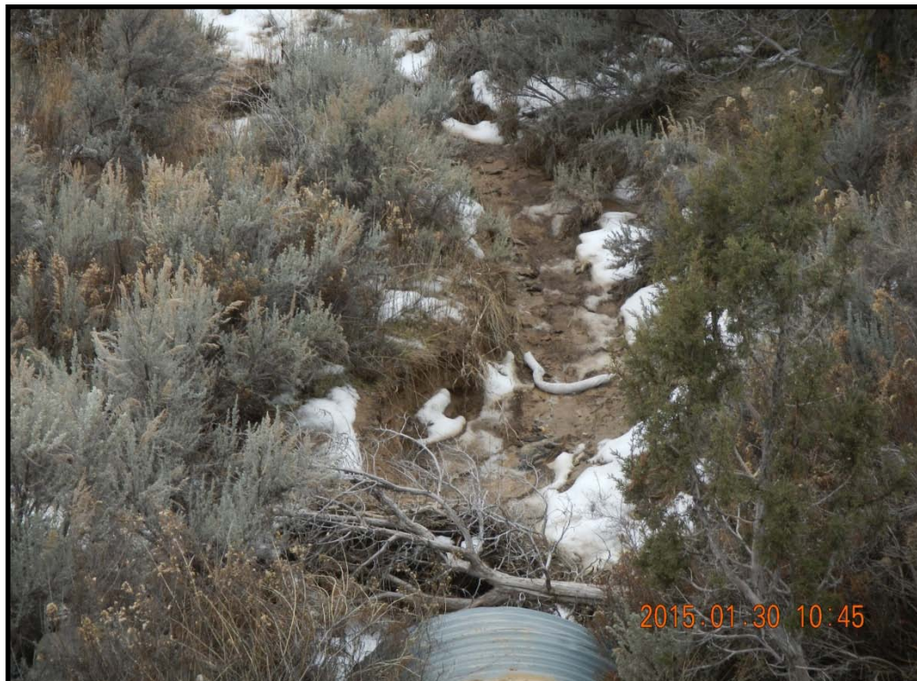
Dry Creek. View upstream. Ephemeral streambed is about 3 feet wide. Almost fully vegetated. One soil sample was taken upstream of the culvert and one further upstream of the spill location.