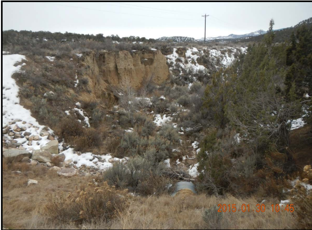
Dry Creek. View upstream. See culvert inlet