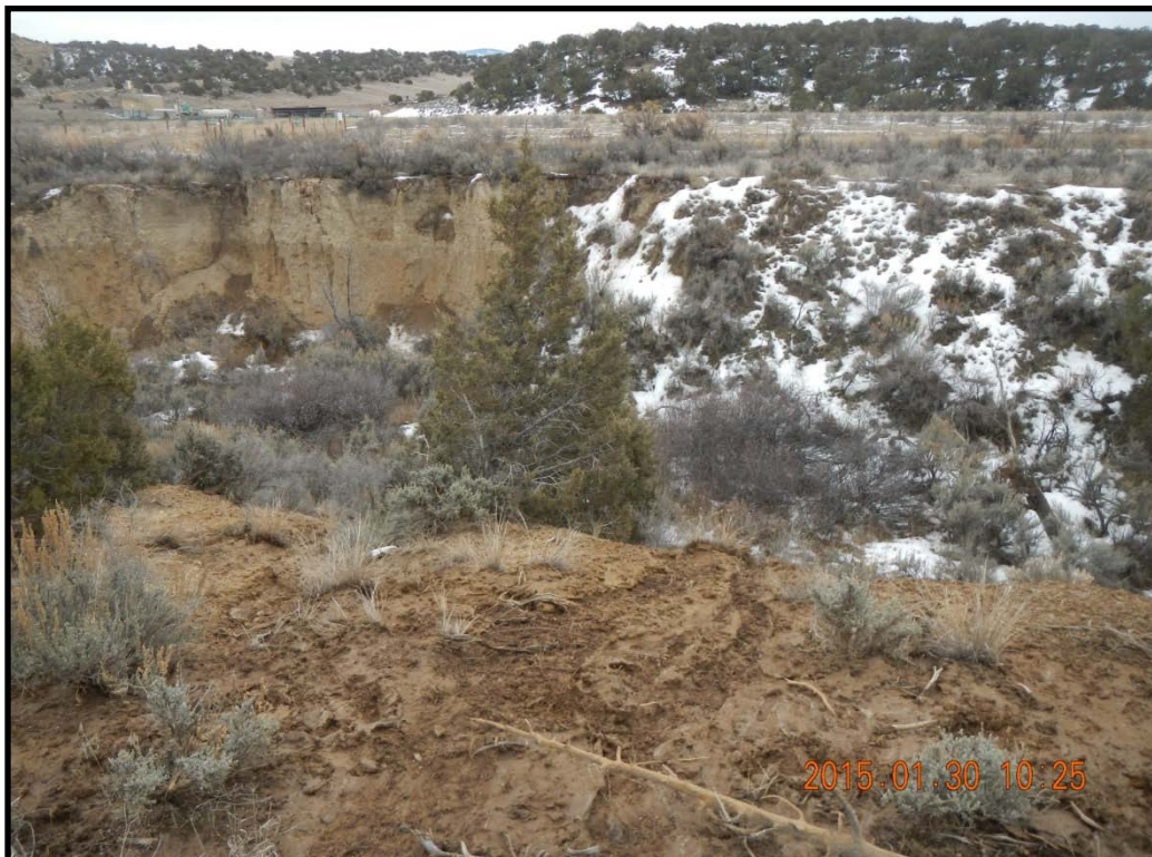
Looking East. Produced water flowed downhill into Dry Creek.