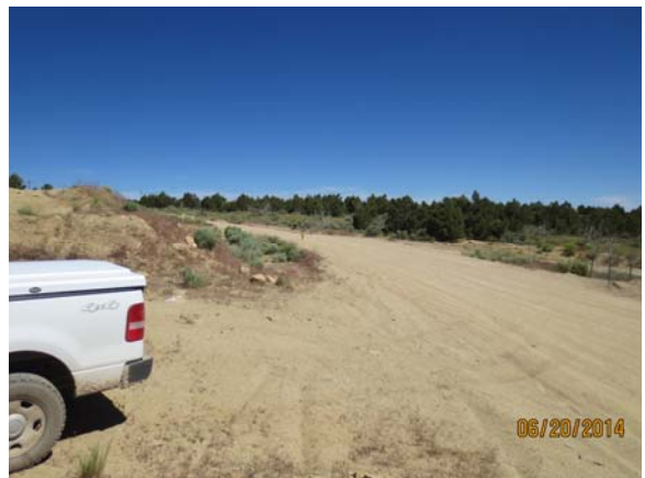
PAD ACCESS LOOKING NORTHERLY

136 East Third Street Rifle, Colorado 81650 Ph. (970) 625-2720 Fax (970) 625-2773