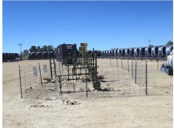
PAD LOCATION LOOKING SOUTH