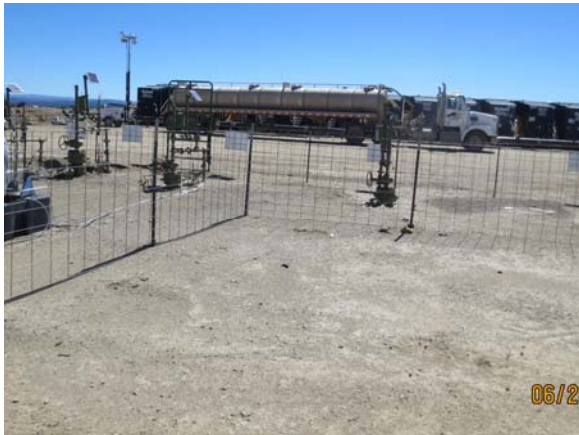
PAD LOCATION LOOKING WEST