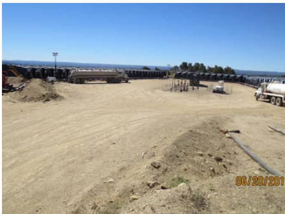
PAD OVERALL LOOKING SOUTHERLY