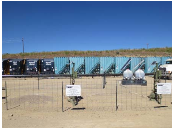
PAD LOCATION LOOKING EAST