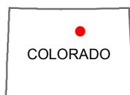
FIGURE 1 SITE LOCATION MAP HOWARD 3C, 28N, 29N-28HZ, HOWARD 16N, 37C, 38C-33HZ, D&C FARMS 14N, 35C, 36C-33HZ SESW SEC 28-1N-R67W WELD COUNTY, COLORADO KERR-MCGEE OIL & GAS ONSHORE LP