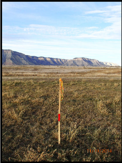
Watson Ranch B Looking North