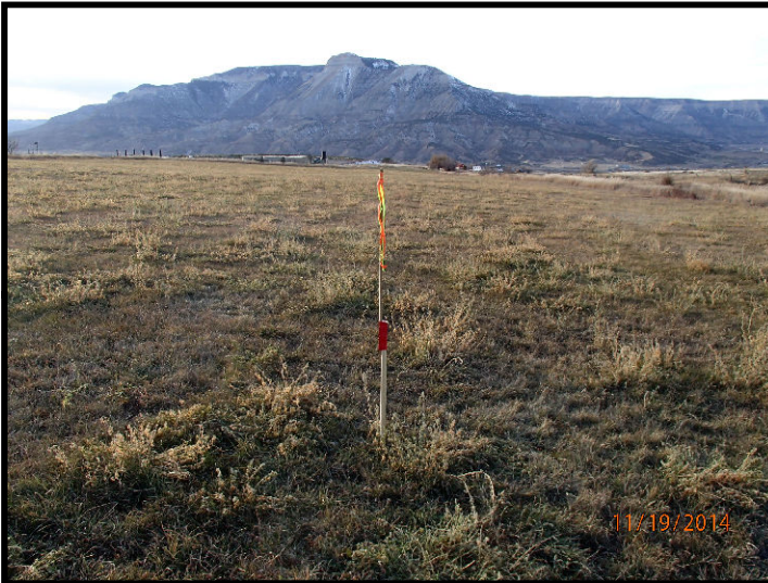
Watson Ranch B Looking West