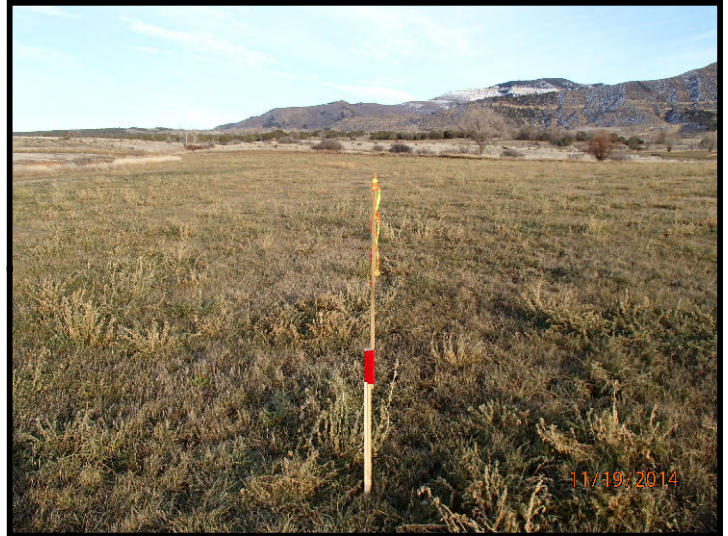
Watson Ranch B Looking East