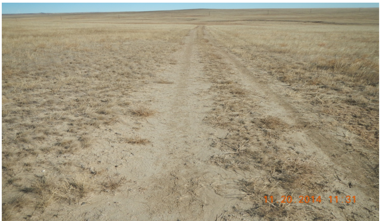
photo 2: Access road has not been de-compacted and does not have sufficient vegetation.