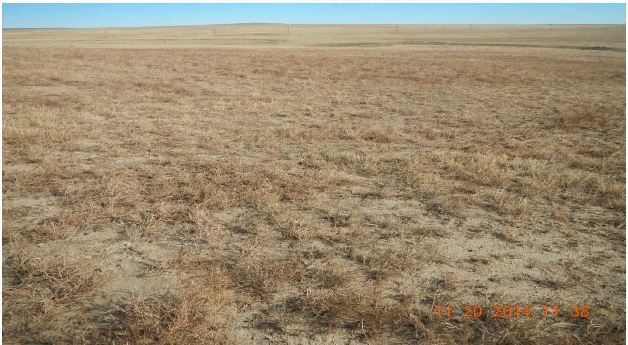
photo 8: Southwest corner of the location facing towards the Northeast.