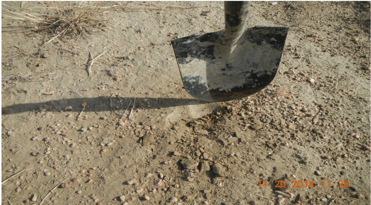
photo 9: Shovel could not break through soil surface indicating soil compaction along the access road.