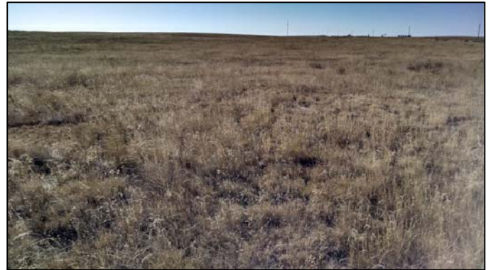
REFERENCE LOCATION LOOKING WEST

\\TSS200DE\A\Share\FES\Projects\1319-01_BONANZA\62W\dwg\WHITETAIL F-4 MAP.dwg SAVED DATE 2014-11-04 11:51