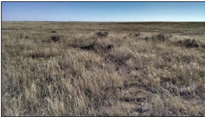
REFERENCE LOCATION LOOKING SOUTH