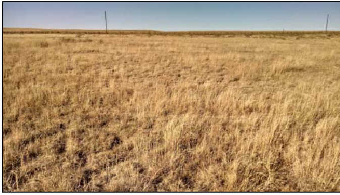
REFERENCE LOCATION LOOKING NORTH