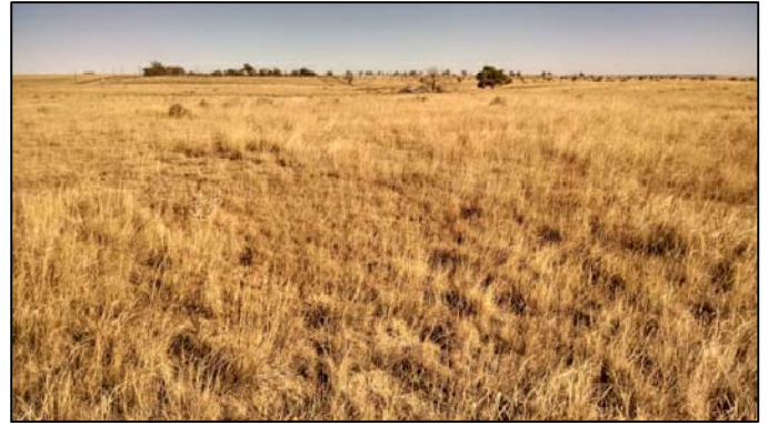
REFERENCE LOCATION LOOKING EAST