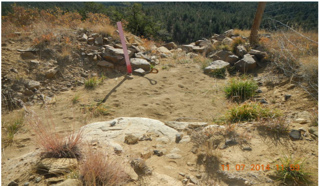
photo 4: Sediment trap at the Southeast corner of location is filled with sediment.