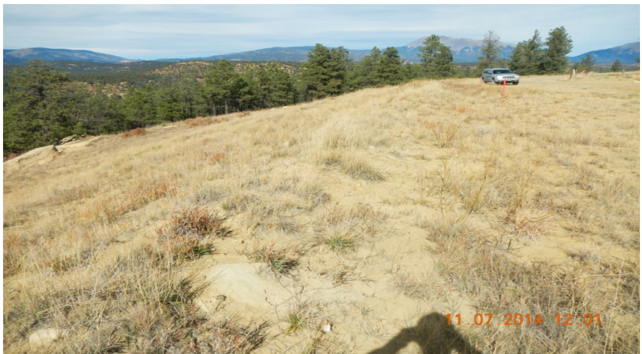
photo 8: Vegetation on the West side of location facing to the North.