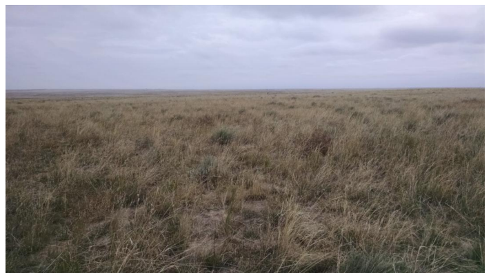
REFERENCE LOCATION LOOKING WEST

C:\FES PROJECTS\1319-01_BONANZA\5N-62W.dwg SECTION 1_MAP24.dwg SAVED DATE 2014-10-13 16:16