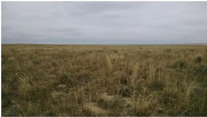
REFERENCE LOCATION LOOKING SOUTH