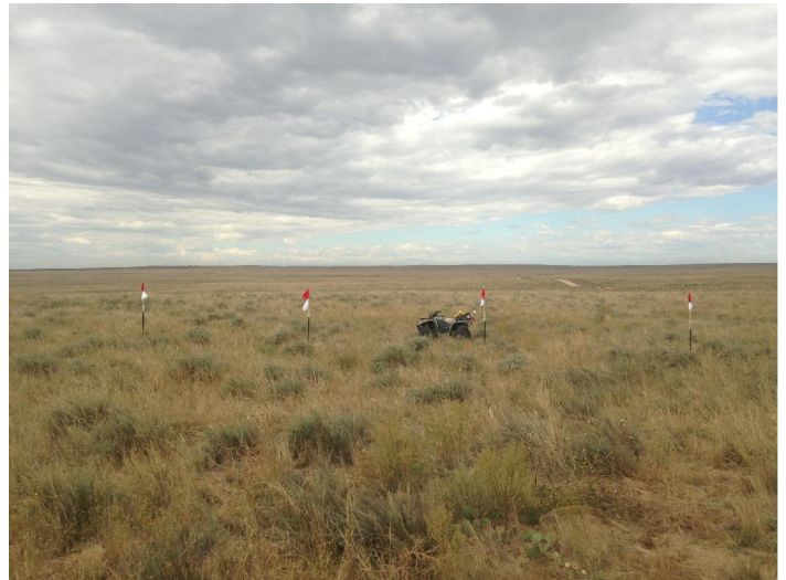
LOCATION LOOKING WEST

C:\VES PROJECTS\1319-01_BONANZA\5N-62W.dwg\SECTION 1_MAP24.dwg SAVED DATE 2014-10-13 16:16