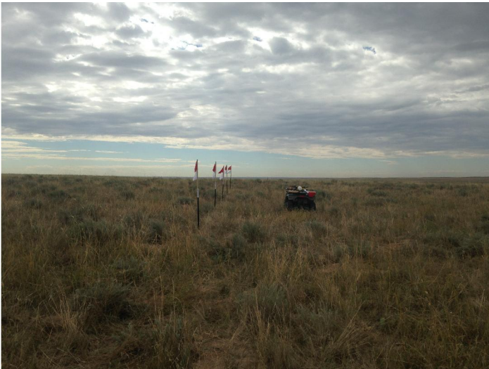
LOCATION LOOKING SOUTH