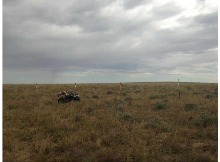
LOCATION LOOKING EAST