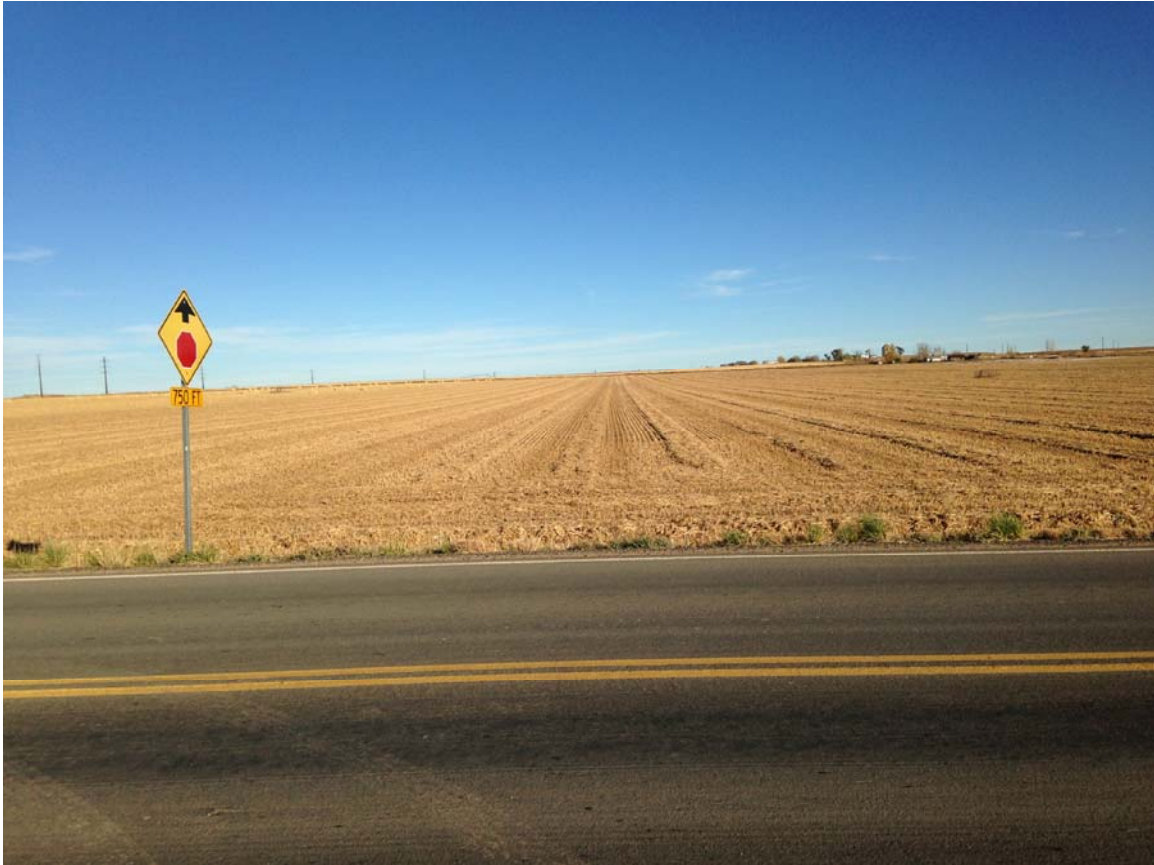
ACCESS AT FACILITY

SECTION 29, TOWNSHIP 2 N, RANGE 64 WEST, 6TH P.M. WELD COUNTY, COLORADO.