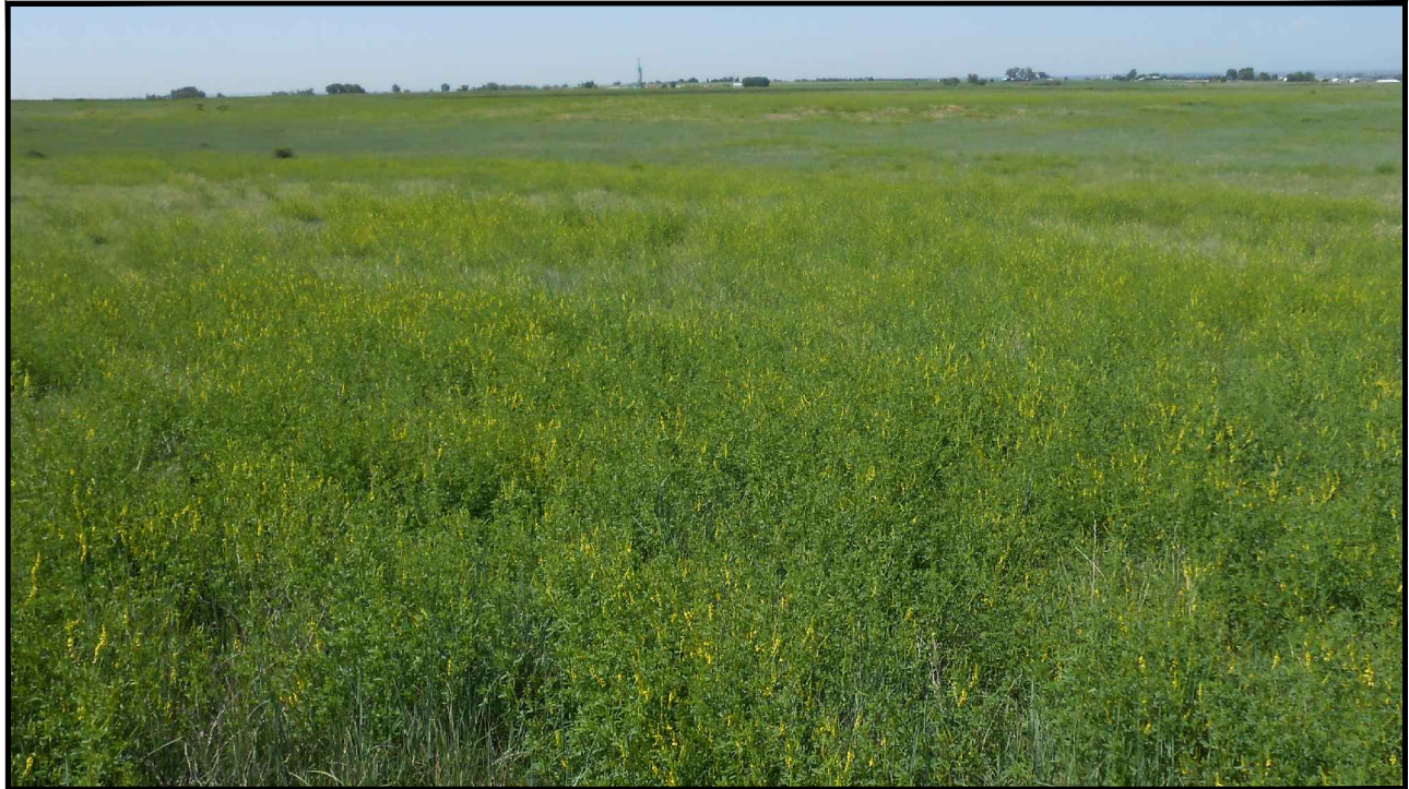
PHOTO: VIEW OF REFERENCE AREA