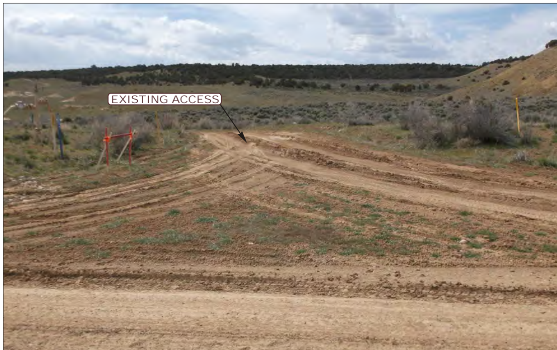
PHOTO: VIEW FROM BEGINNING OF EXISTING ACCESS