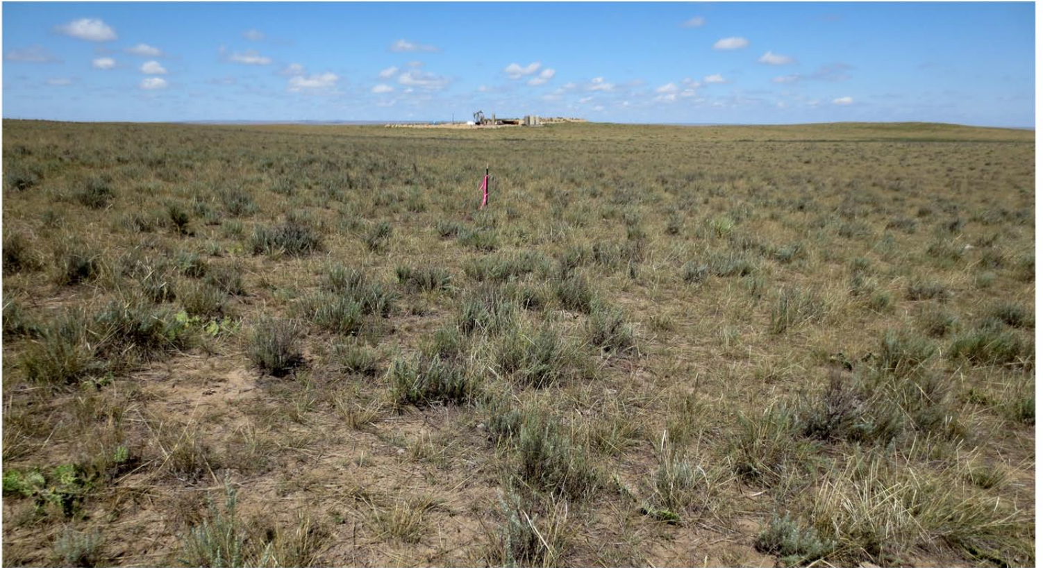
WELL PAD VIEW (LOOKING NORTH)