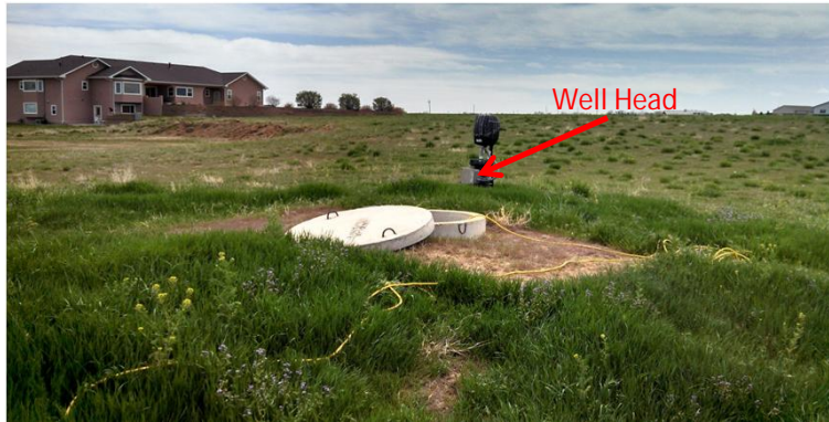
Well and Sample Location