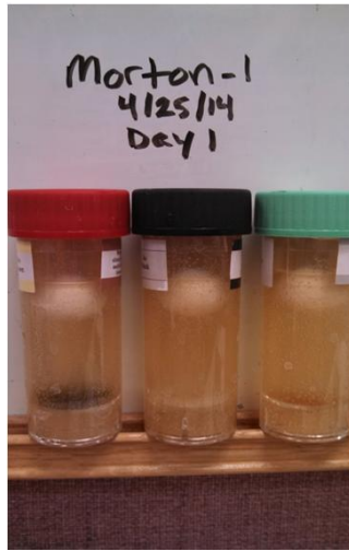
TABLE 2 BART PHOTOGRAPHIC TABLE MORTON WELL COLORADO OIL AND GAS CONSERVATION COMMISSION