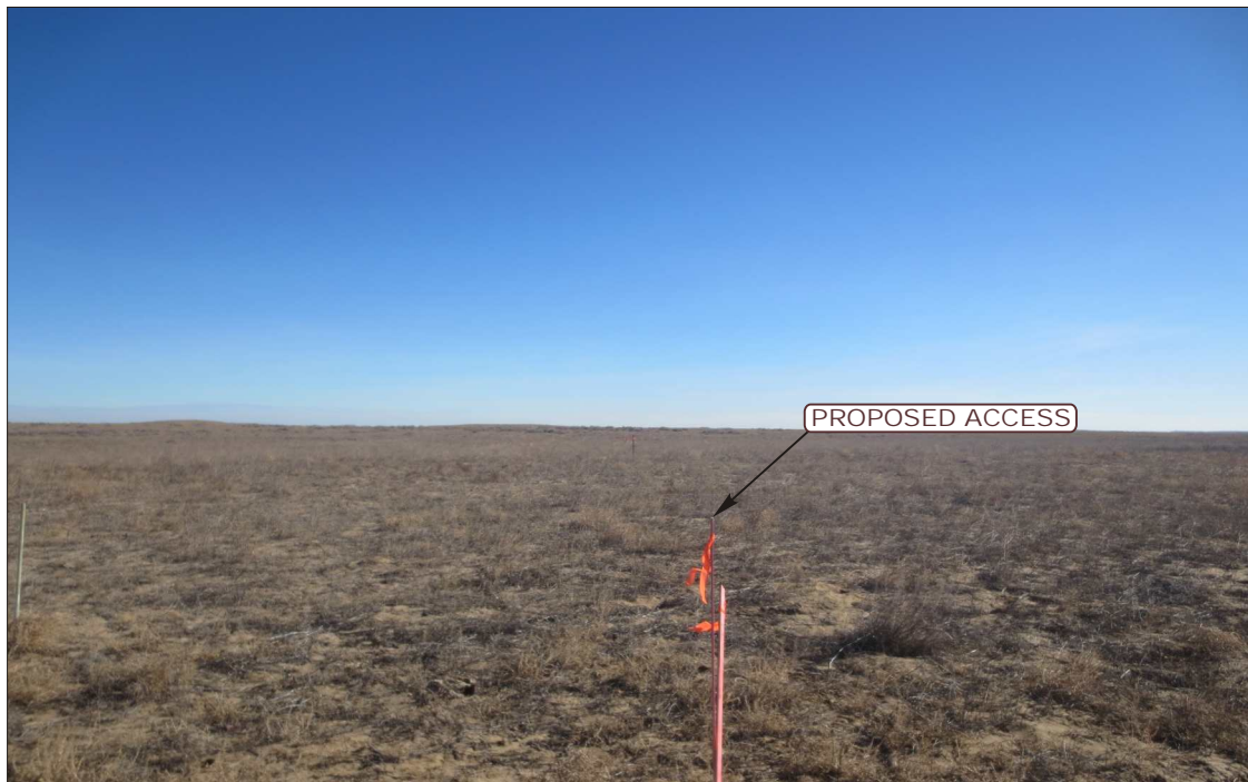
PHOTO: VIEW FROM BEGINNING OF PROPOSED ACCESS FOR ANSCHUTZ EQUUS FARMS 4-62-16 NE PAD