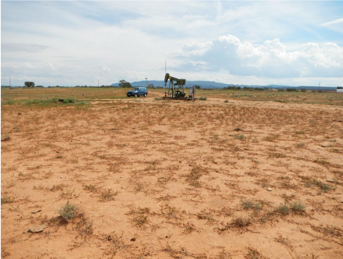
Photo 1. View from southwestern corner of well pad facing center.