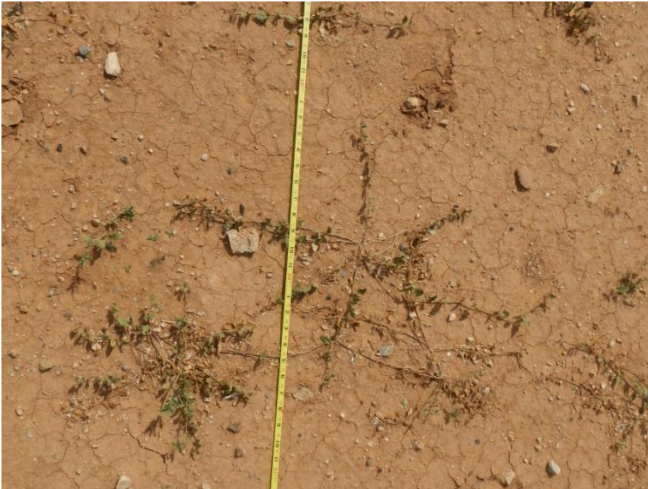
Photo 3. Birdseye view of revegetation at midpoint of vegetation transect within the interim reclamation area of the well pad. Vegetation is field bindweed.