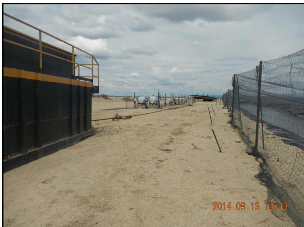
One well is connected to the Frac tank by piping.