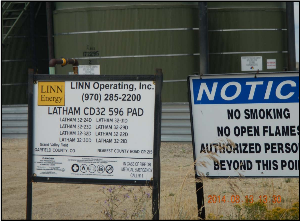
Sign at the entrance