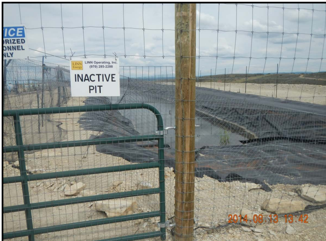
Inactive pit with some water.