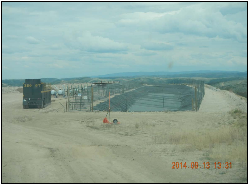
Production pit fenced and netted