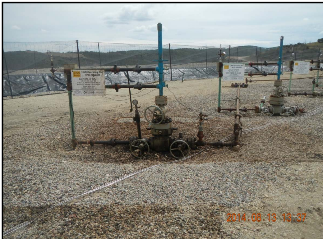
Staining around well and on sign. API 045 13689