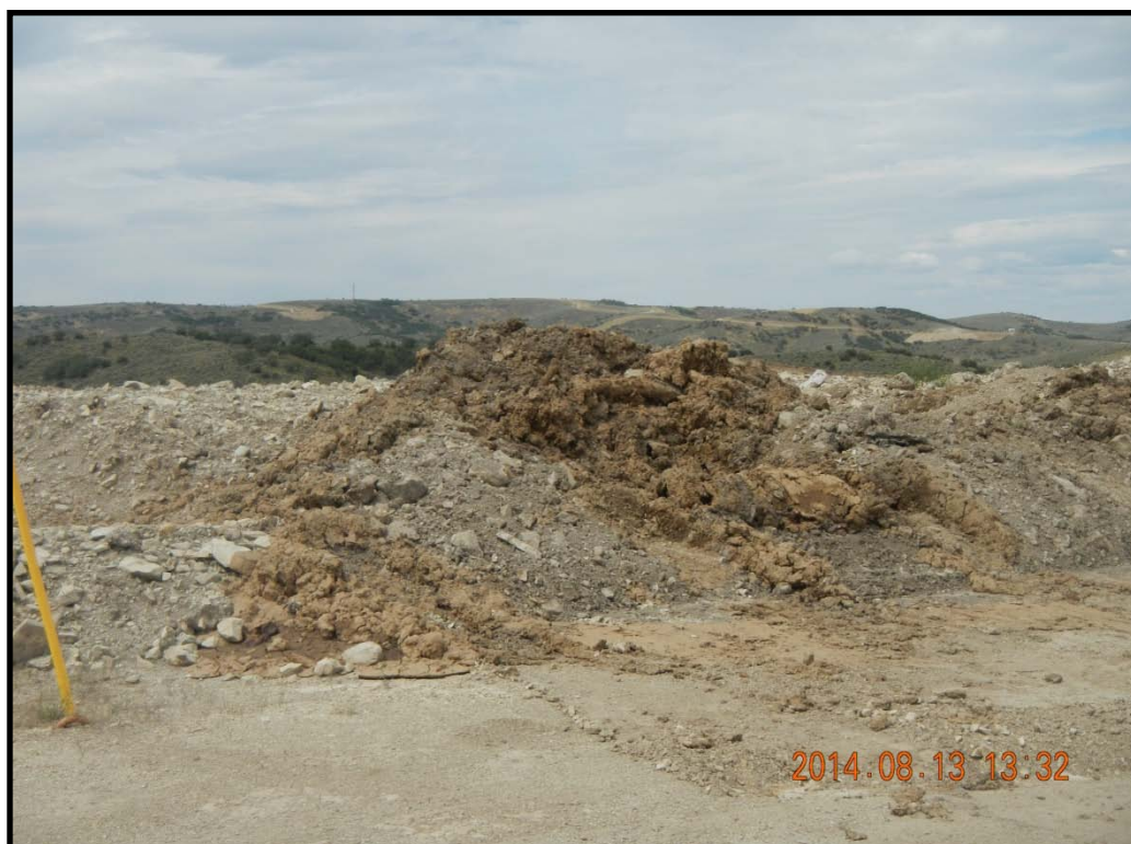
Material dumped over a stockpile berm.