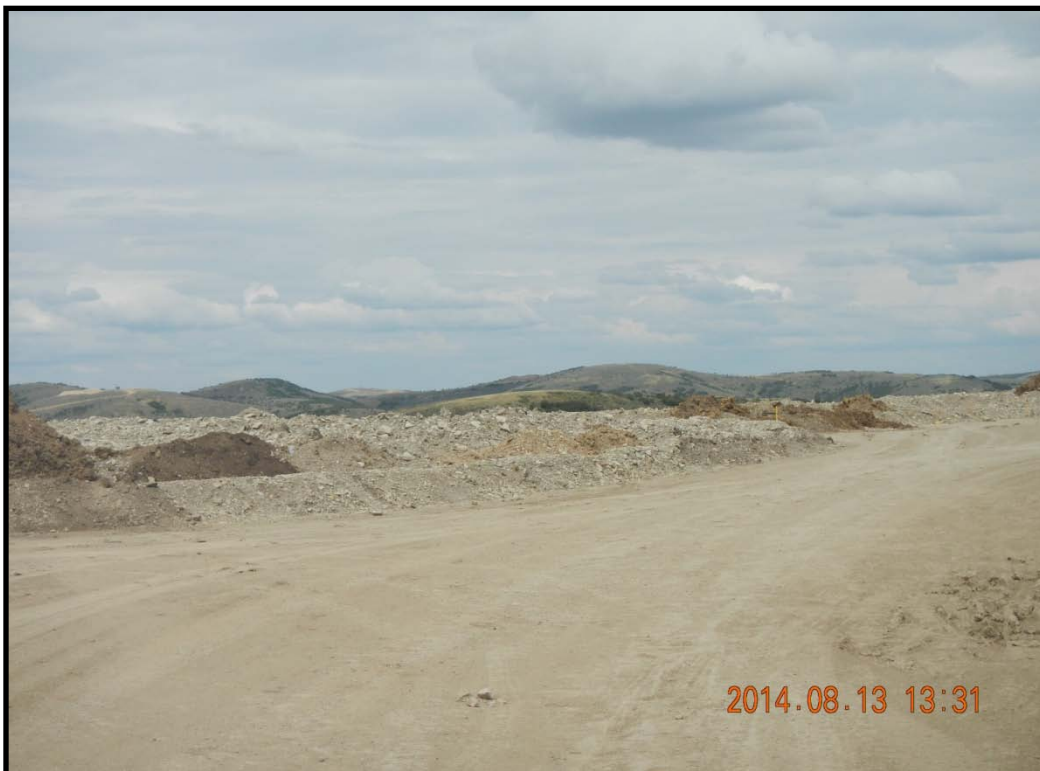
Several stockpiles with older and newer material. Stockpiles extent along the north section of the pad