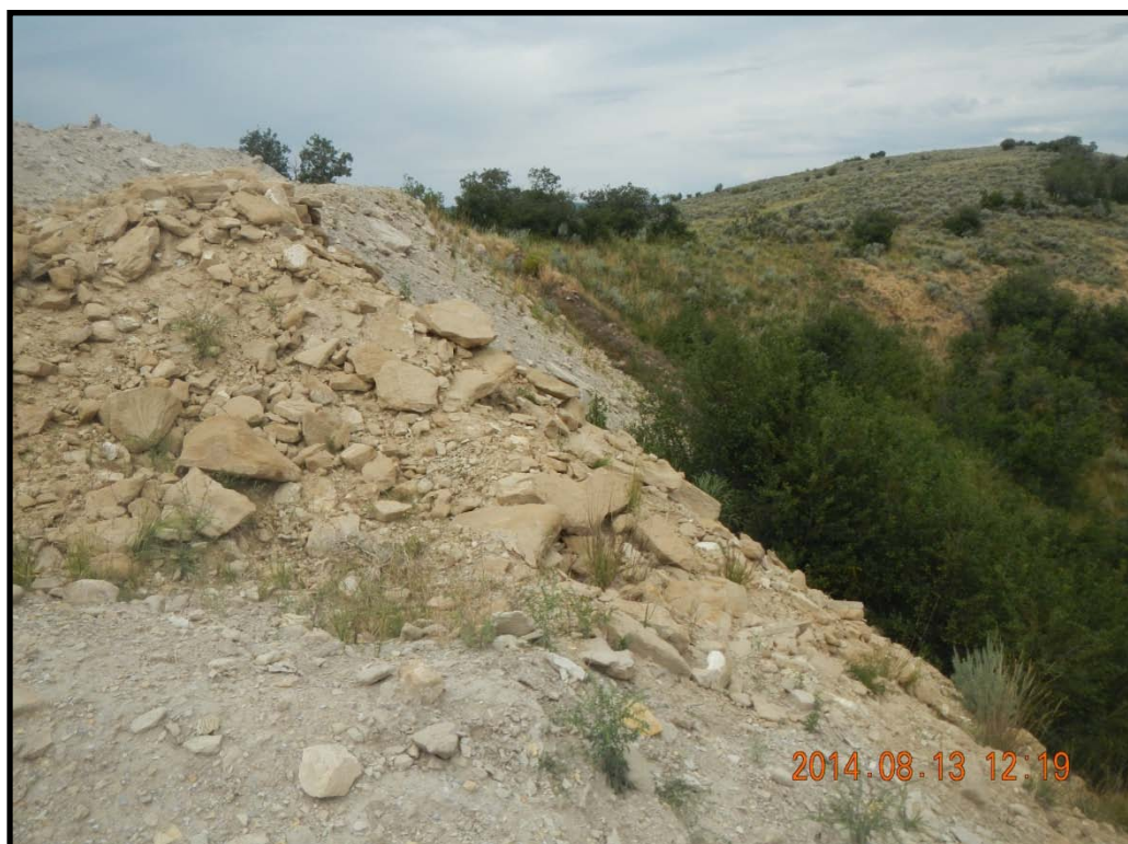
Another stockpile with berm on the edge of the pad. Rocks and debris at risk of sliding down the steep slope.