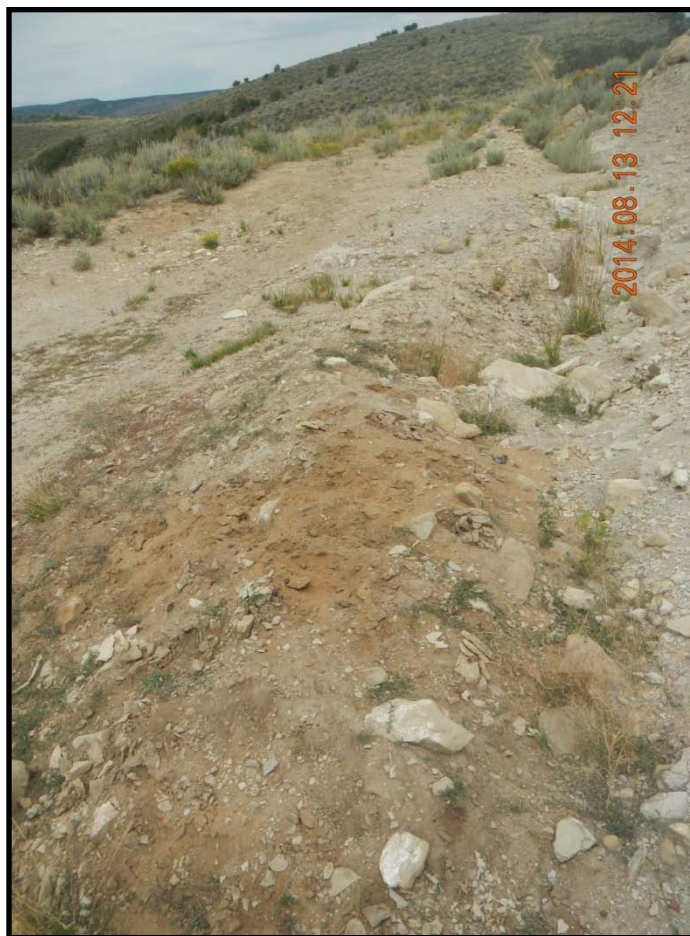
Berm constructed with frack sand. Vegetation growing on berm and stockpile material.