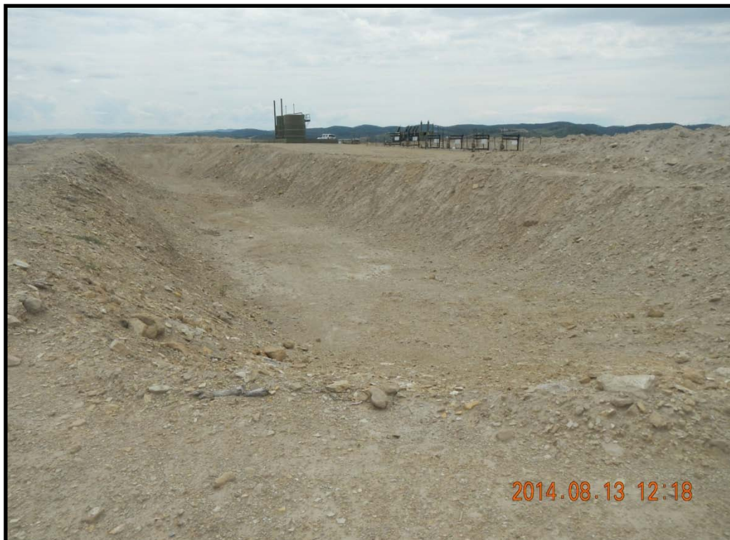
Multiwell pit in process of closure.