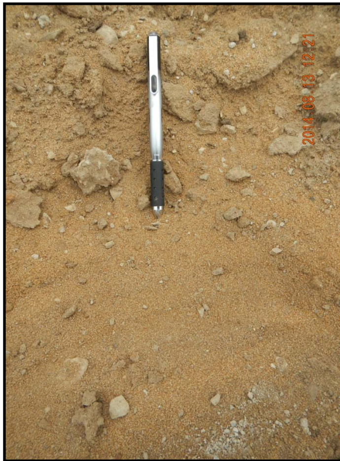
Berm constructed with frack sand.