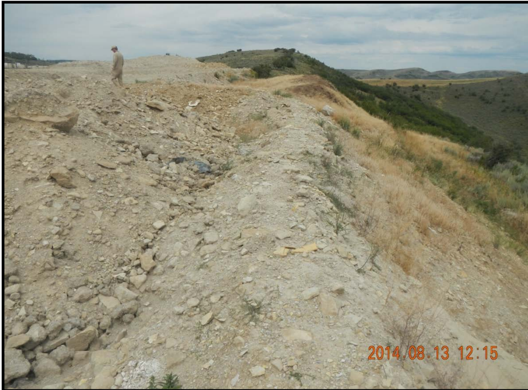
Stockpile on the edge of the pad. Pieces of liner mixed in.