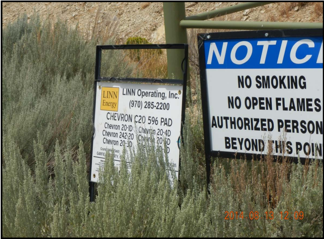
Sign at the entrance