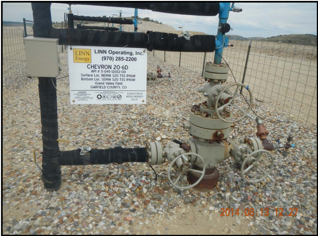
Well heads clean, fenced, labeled.