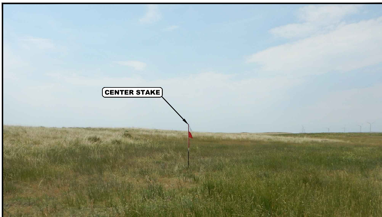
PHOTO: VIEW OF CENTER STAKE