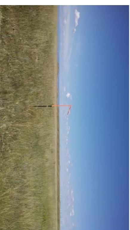
LOOKING WEST 8/8/14