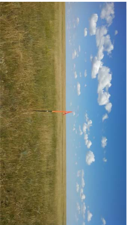
LOOKING NORTH 8/8/14

SECTION 35, TOWNSHIP 12 NORTH, RANGE 66 WEST OF THE 6TH P.M.