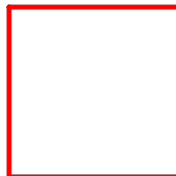
Wellbore Spacing Unit Outline