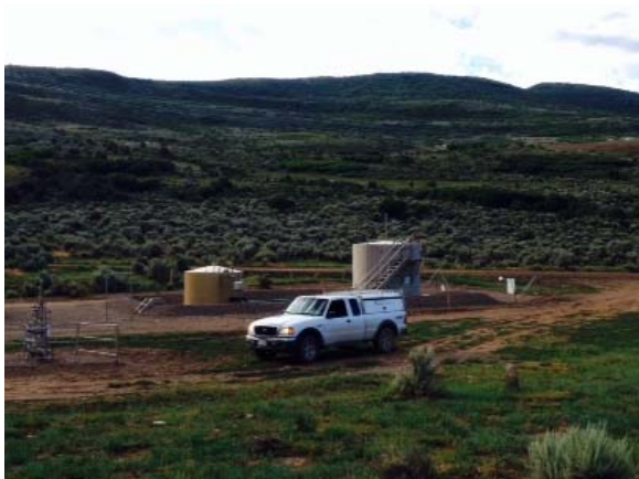
PAD OVERALL LOOKING SOUTHERLY