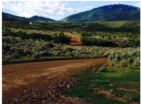
PAD ACCESS LOOKING SOUTHERLY

136 East Third Street Rifle, Colorado 81650 Ph. (970) 625-2720 Fax (970) 625-2773