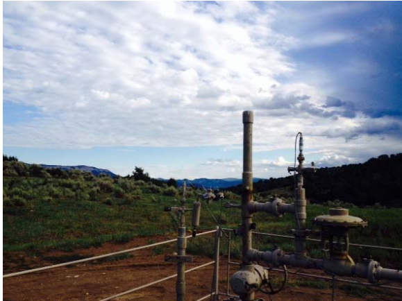
PAD LOCATION LOOKING NORTH