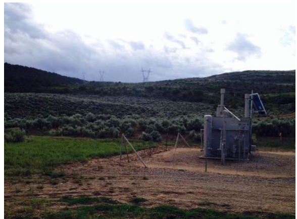
PAD LOCATION LOOKING EAST