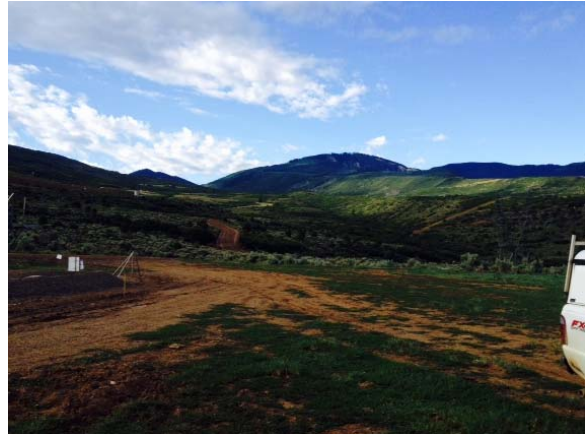
PAD LOCATION LOOKING SOUTH