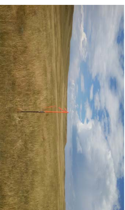
LOOKING WEST 8/7/14