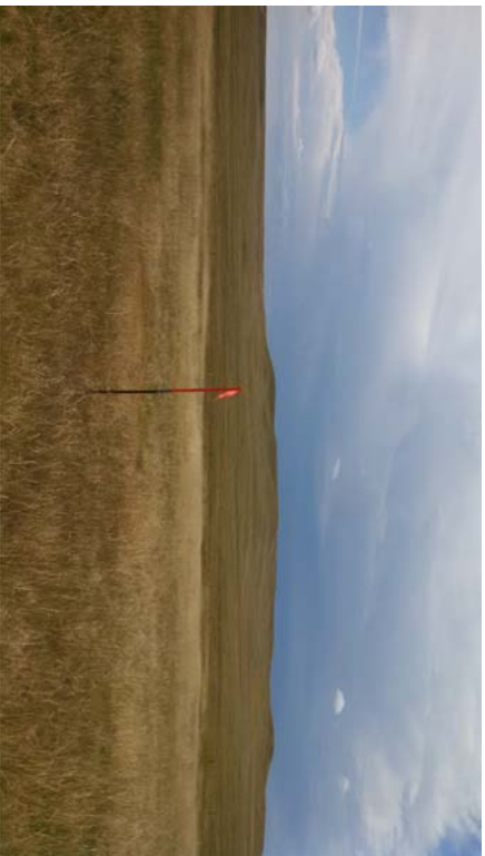
LOOKING SOUTH 8/7/14