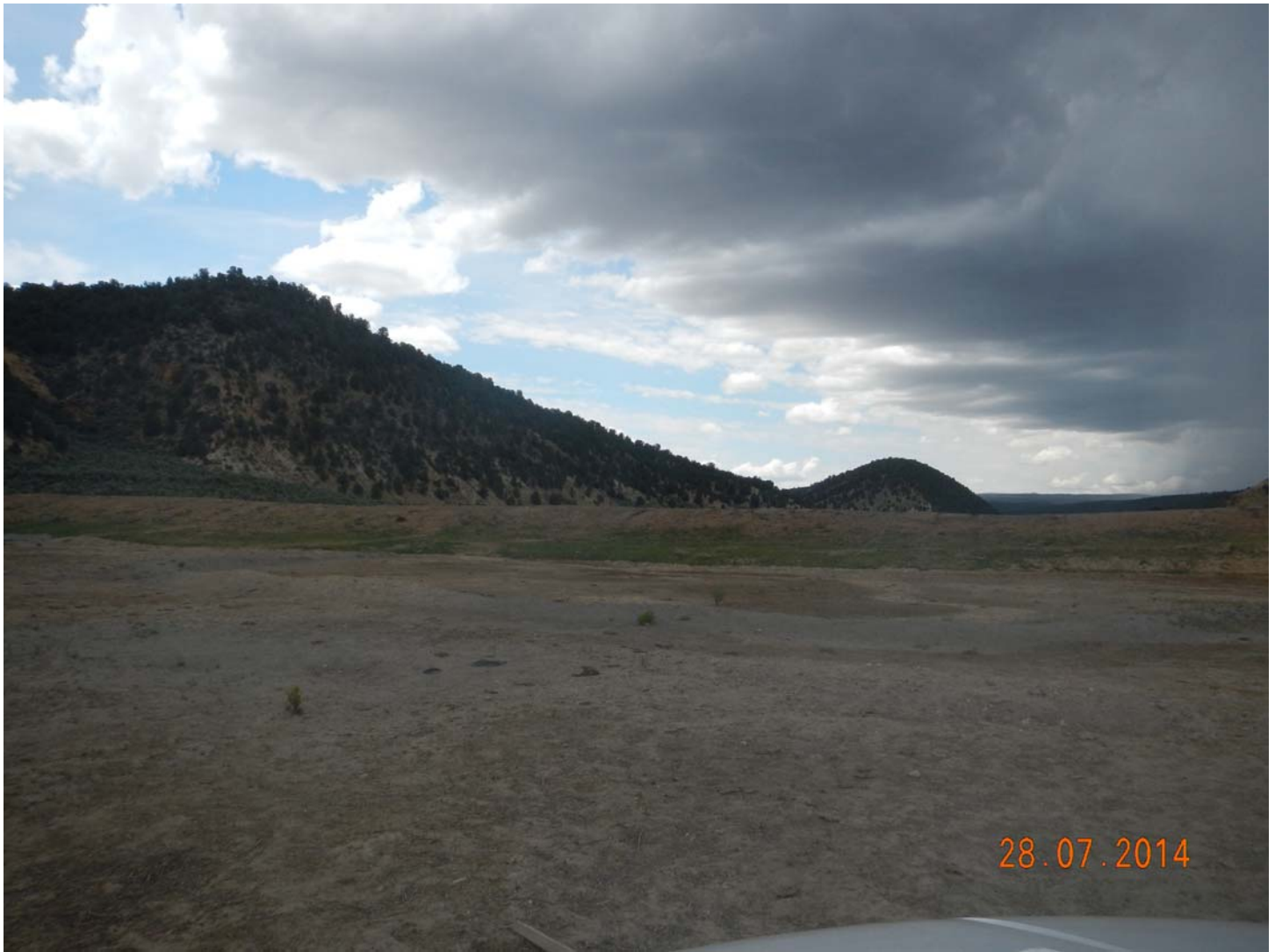
3.) Pit remains.