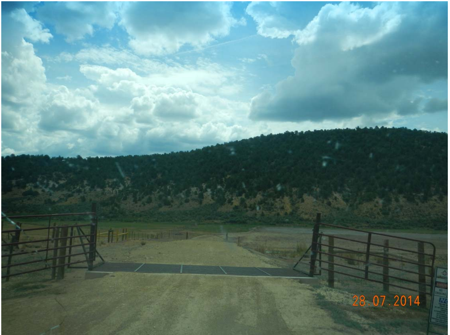
1.) Location entrance. Culvert and cattle guard intact.