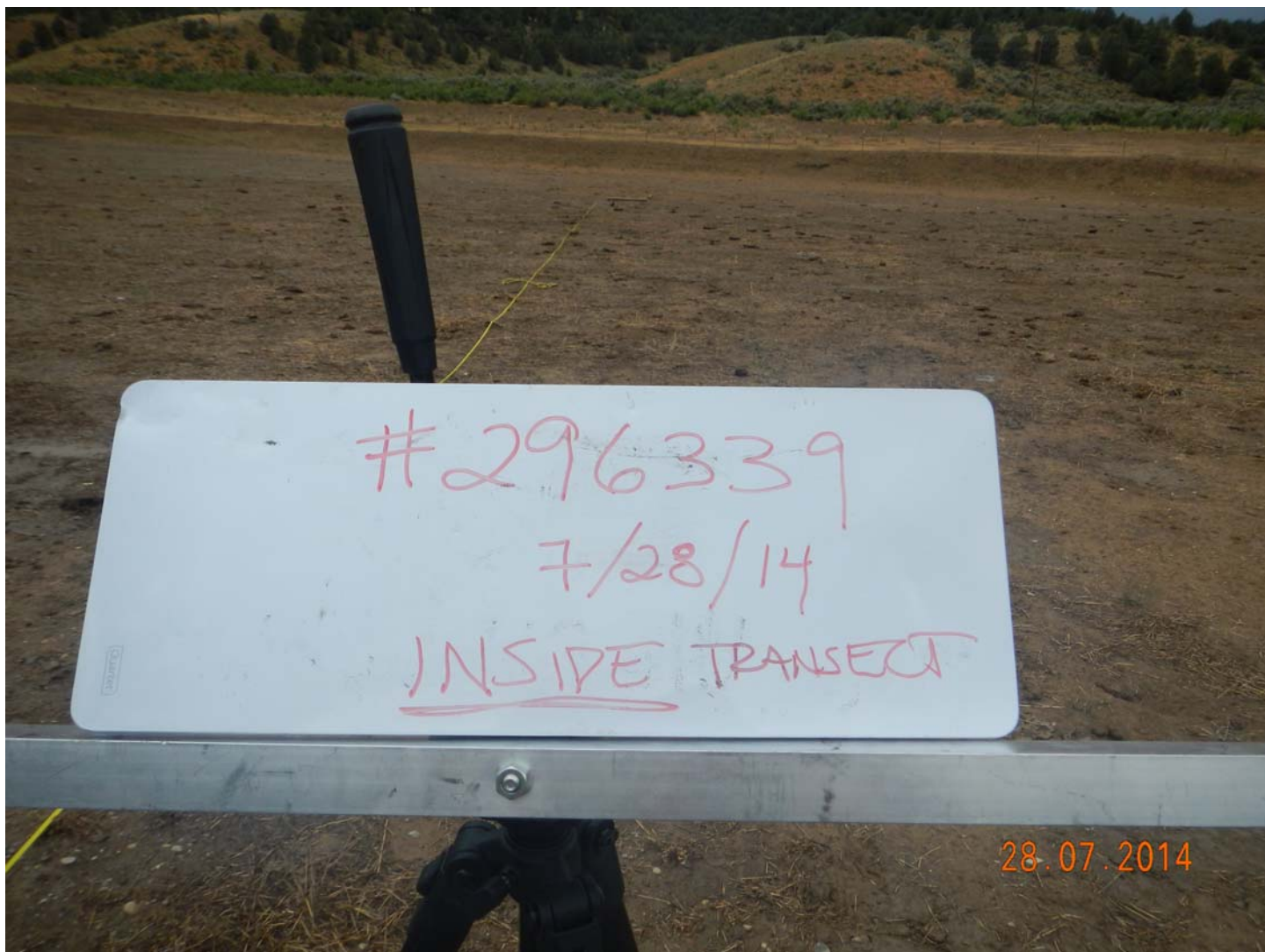
4.) Inside Transect conducted.