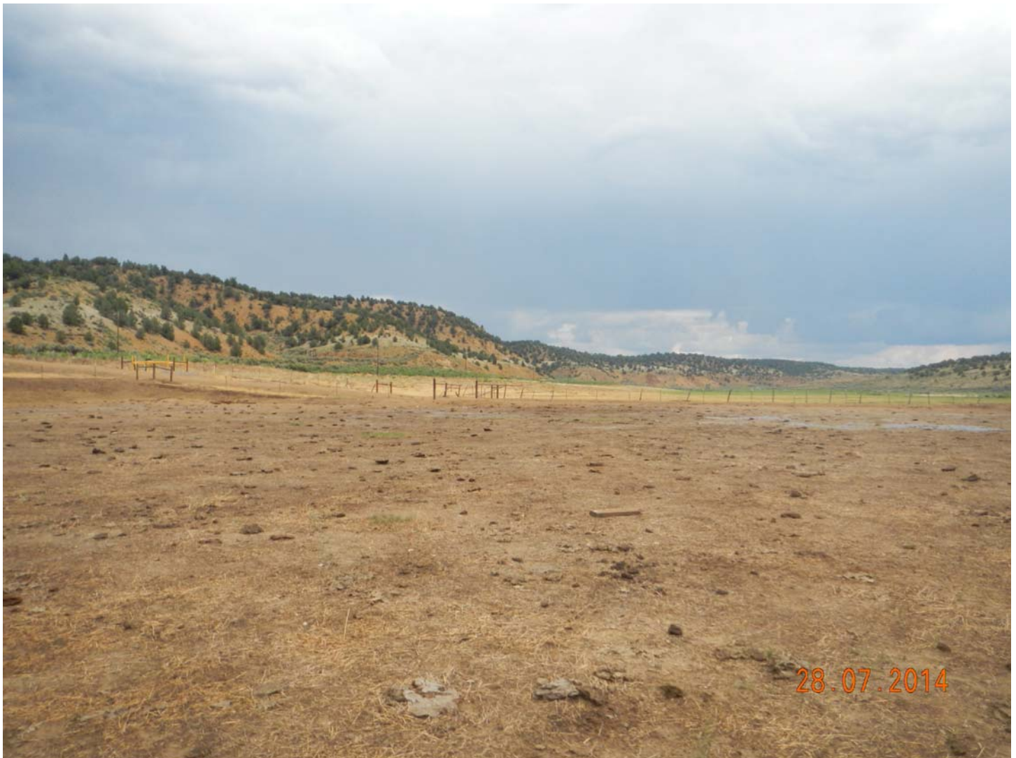
7.) Midpoint perpendicular photo 2