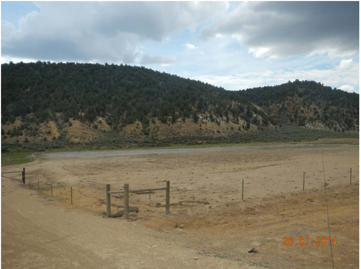
2.) Location BMPS gravel and fencing remain intact.