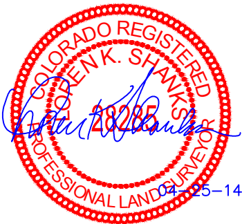
FIGURE #6 SCALE: 1" = 1000' DATE: 03-29-14 DRAWN BY: J.S.

JENCKS 6-61-8_5 SWSW PAD #6-61-8-6203BH2, 6302BH2 & 6401BH2 SECTION 8, T6N, R61W, 6th P.M. SW 1/4 SW 1/4