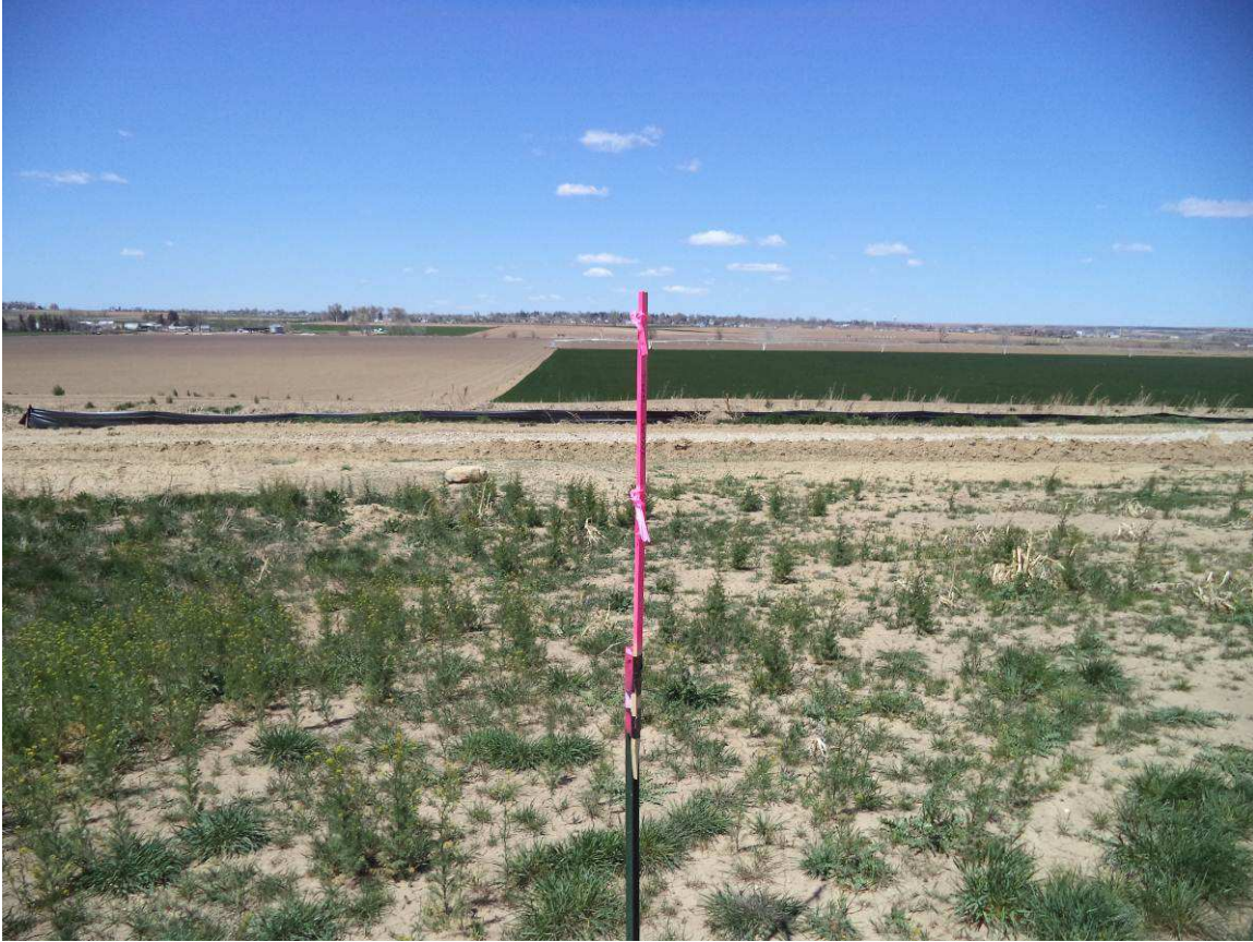
Figure 1: WIND PAD LOOKING NORTH (SE1/4 SW1/4 SEC 17, T4N, R67W, 5-1-2014)