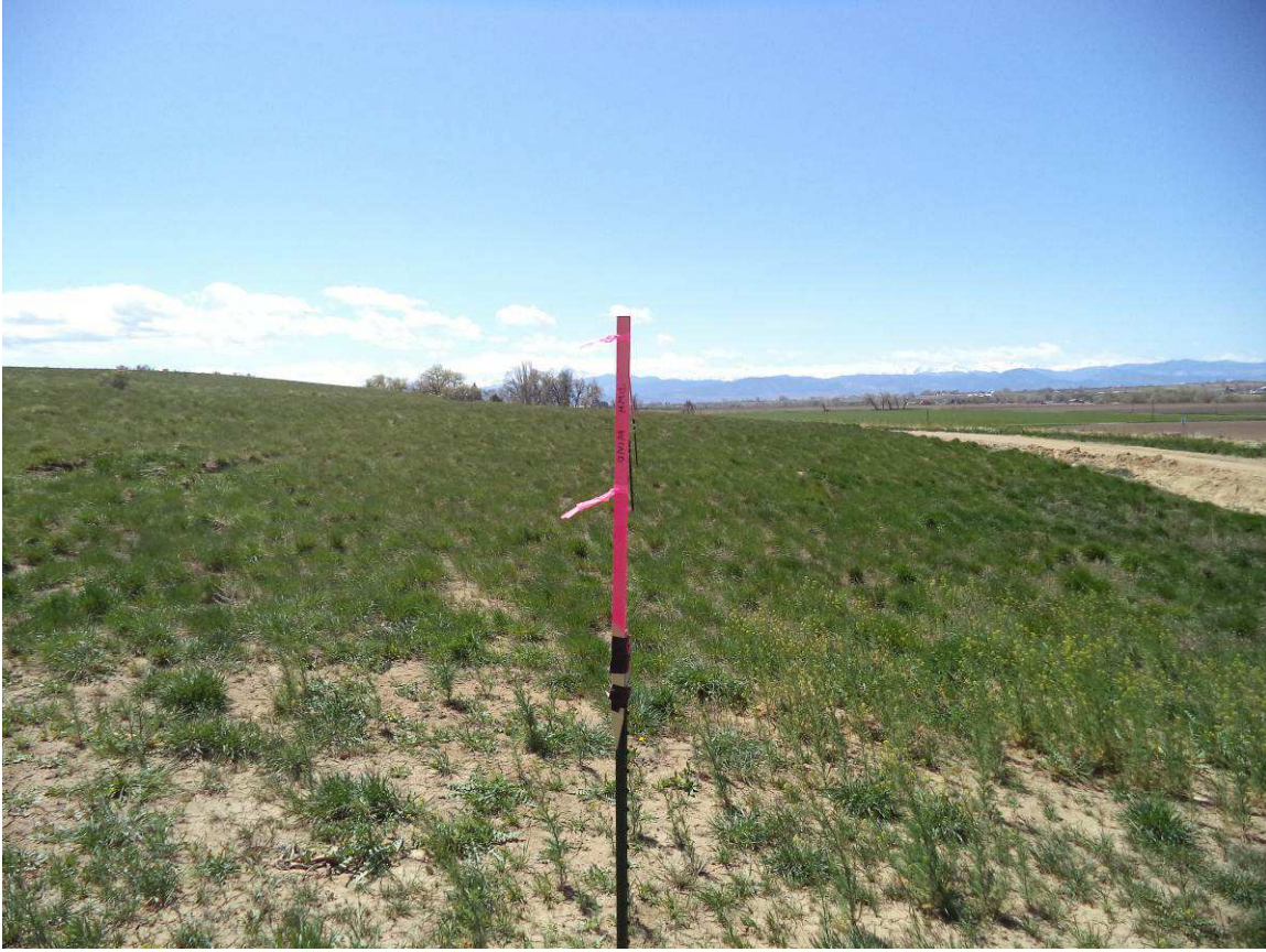
Figure 4: WIND PAD LOOKING WEST TOWARDS ACCESS ROAD (SE1/4 SW1/4 SEC 17, T4N, R67W, 5-1-2014)