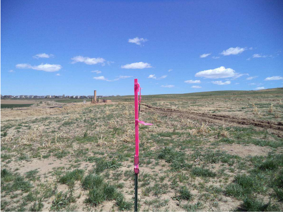
Figure 2: WIND PAD LOOKING EAST (SE1/4 SW1/4 SEC 17, T4N, R67W, 5-1-2014)