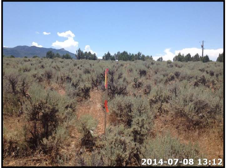
Tompkins Looking South