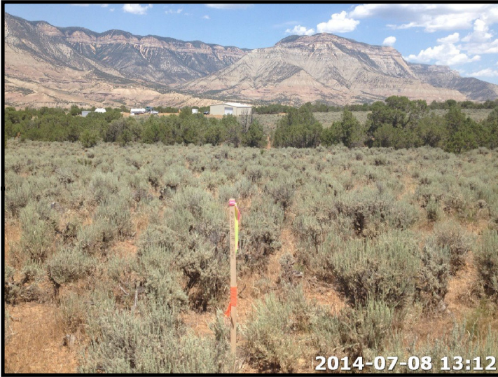
Tompkins Looking North