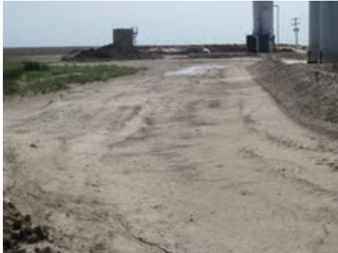
Idea_area for proposed land farm site.JPG 2667K