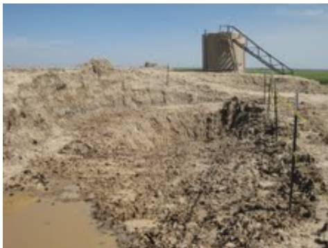
Idea_ongoing remediation project.JPG 3213K