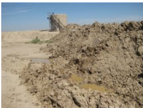
Idea_soil removed from skim pit site #2.JPG 3307K