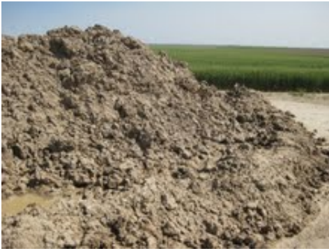
Idea_soil removed from skim pit site.JPG 3604K