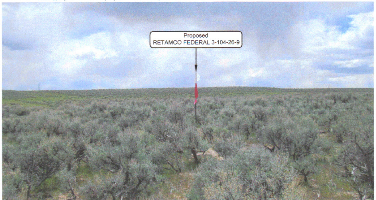
PHOTO LOCATION: LATITUDE LONGITUDE NAD 83: (40° 11' 56.21"N) (109° 01' 48.26"W)