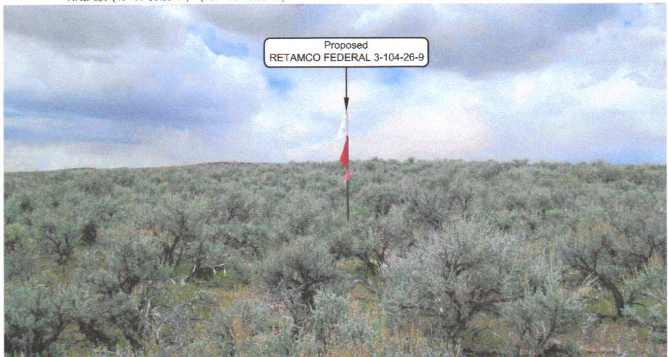
PHOTO LOCATION: LATITUDE LONGITUDE NAD 83: (40° 11' 55.45"N) (109° 01' 47.57"W)