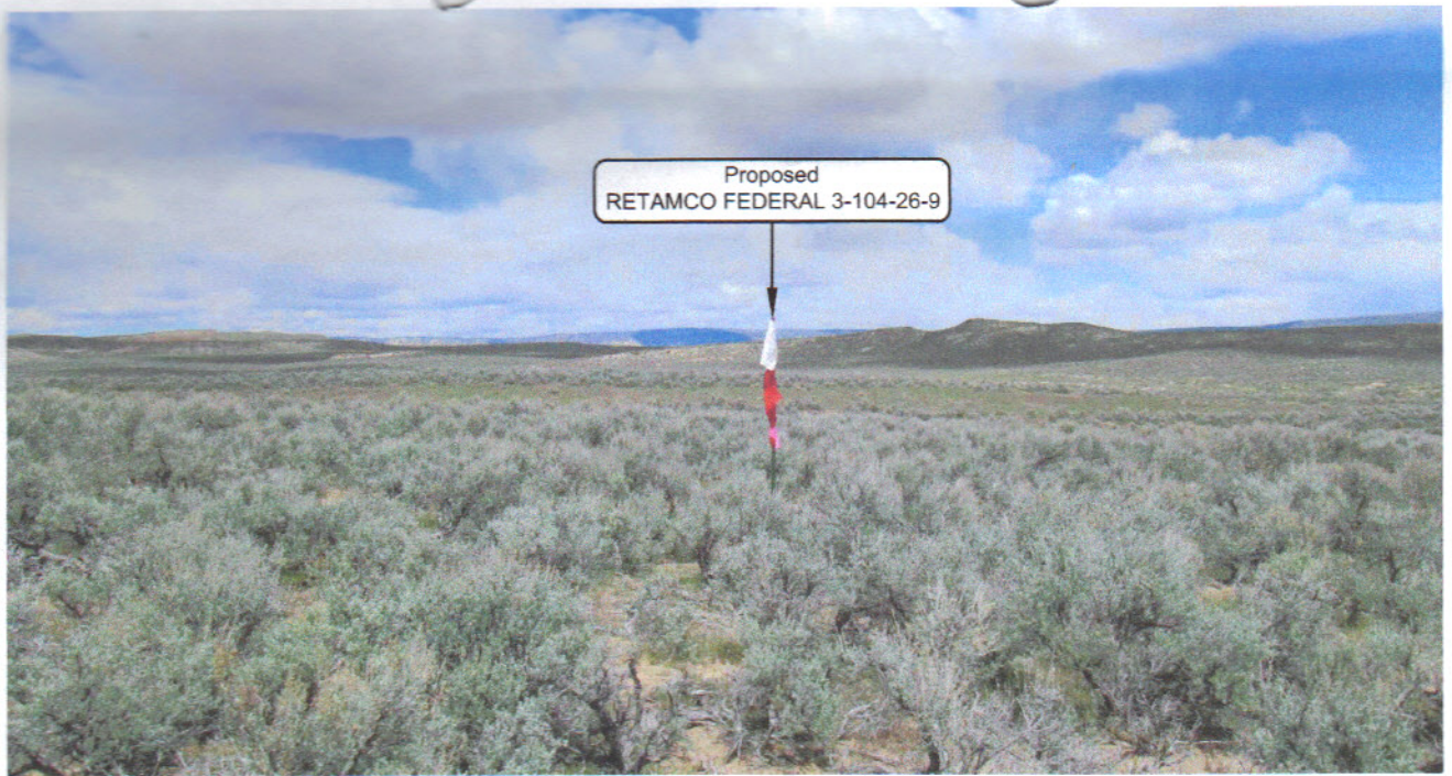
PHOTO LOCATION: LATITUDE LONGITUDE NAD 83: (40° 11' 54.85"N) (109° 01' 48.25"W)