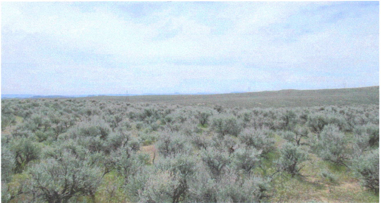
PHOTO LOCATION: LATITUDE LONGITUDE NAD 83: (40° 11' 47.30"N) (109° 01' 57.72"W)